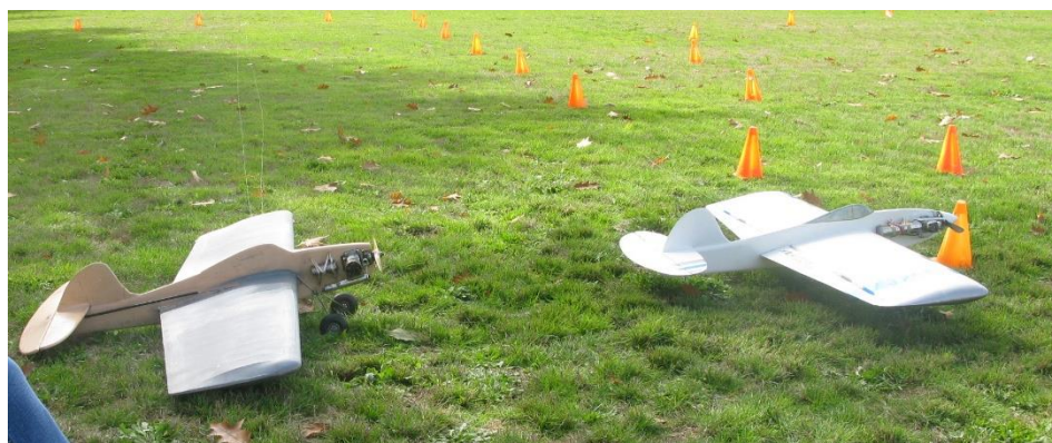
RingMonster I (left) and Ringmonster II (right).....78 vs .46.....they both work!