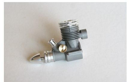
Profi .8cc & 1.0cc FF $259.95 each