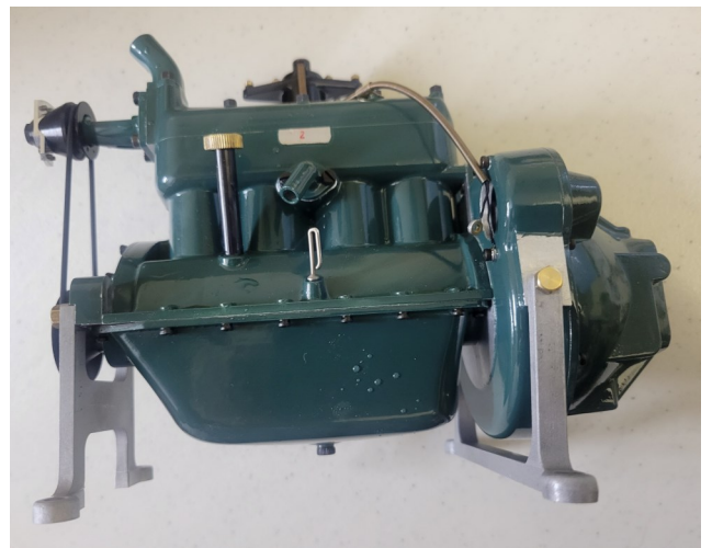
Profi-Ford A 1:6 Scale $3,99.95