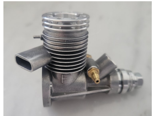
Fora 1.0cc (.061) $259.95