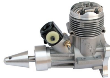
Profi 6.5cc (.40cid) w/m Q-500 $549.95