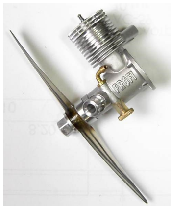
Profi .8cc & 1.0cc (.049 & .061) $259.95 each