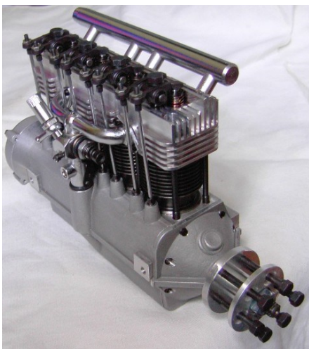
Profi 17cc Cirrus 4-Cyl In-Line $2,599.95