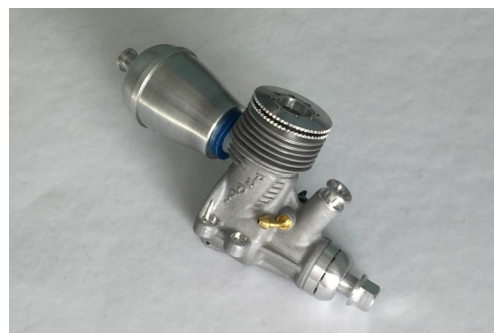
Profi F2D 2.5cc (.15) $279.95