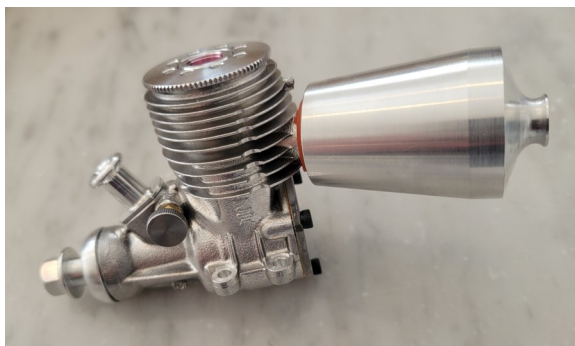
Fora F2D 2.5cc (.15) $279.95