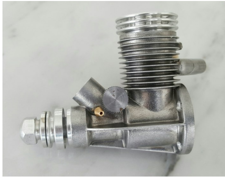
Fora .8cc (.049) $259.95