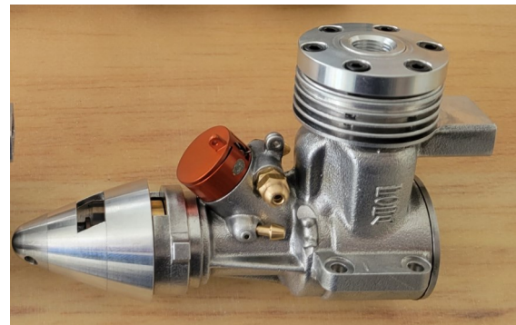
Fora F1C 2.5cc (.15) $499.95