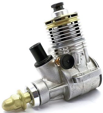
Fora 2.5cc (.15cid) Jr. Diesel $259.95