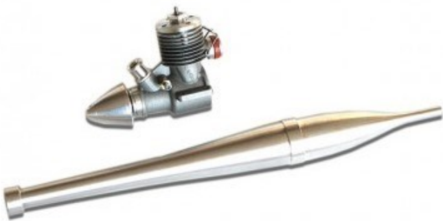
Profi .8cc (.049cid) Speed w/Pipe $395.00