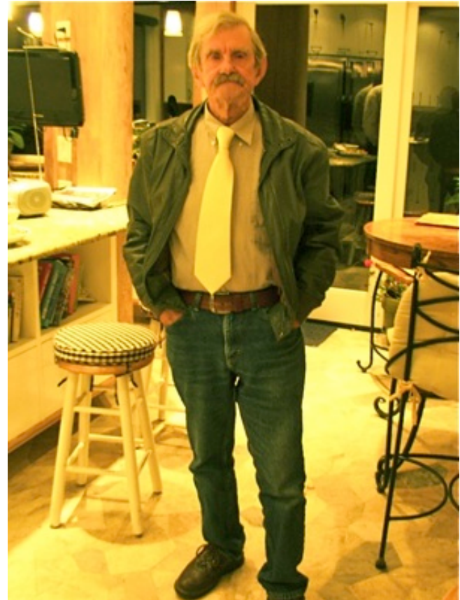
LEO IN A FINE TIE