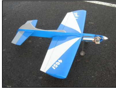
Ready for maiden flight