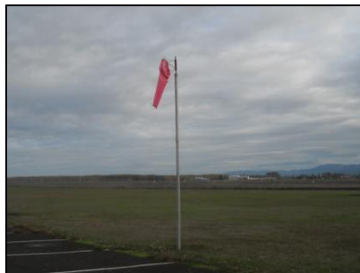
Wind without any direction