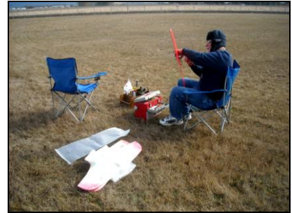
Motor testing from a chair!