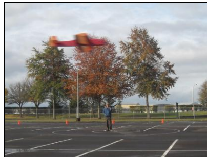
Floyd flying well