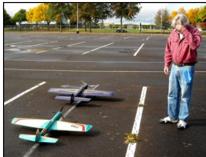
Both ready to fly