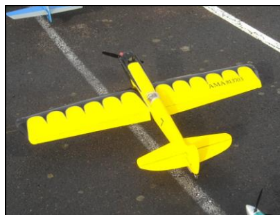
Ready for maiden flight