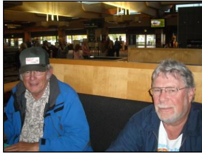
The other two