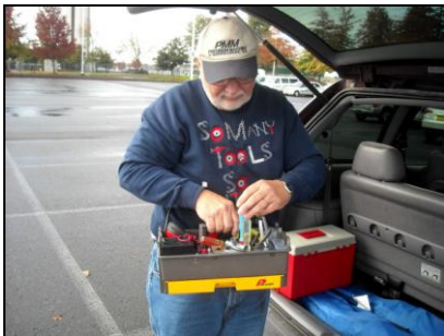
New tool kit