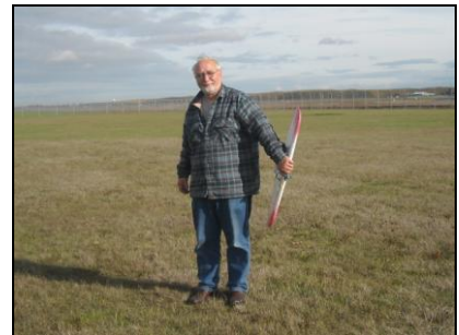
Gene testing motor