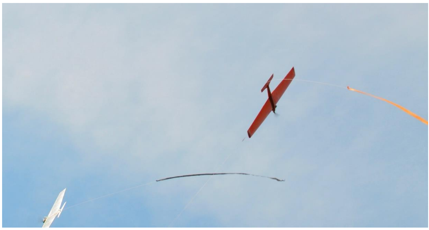
Joe Fustolo and Brian Stas mix it up early in the contest