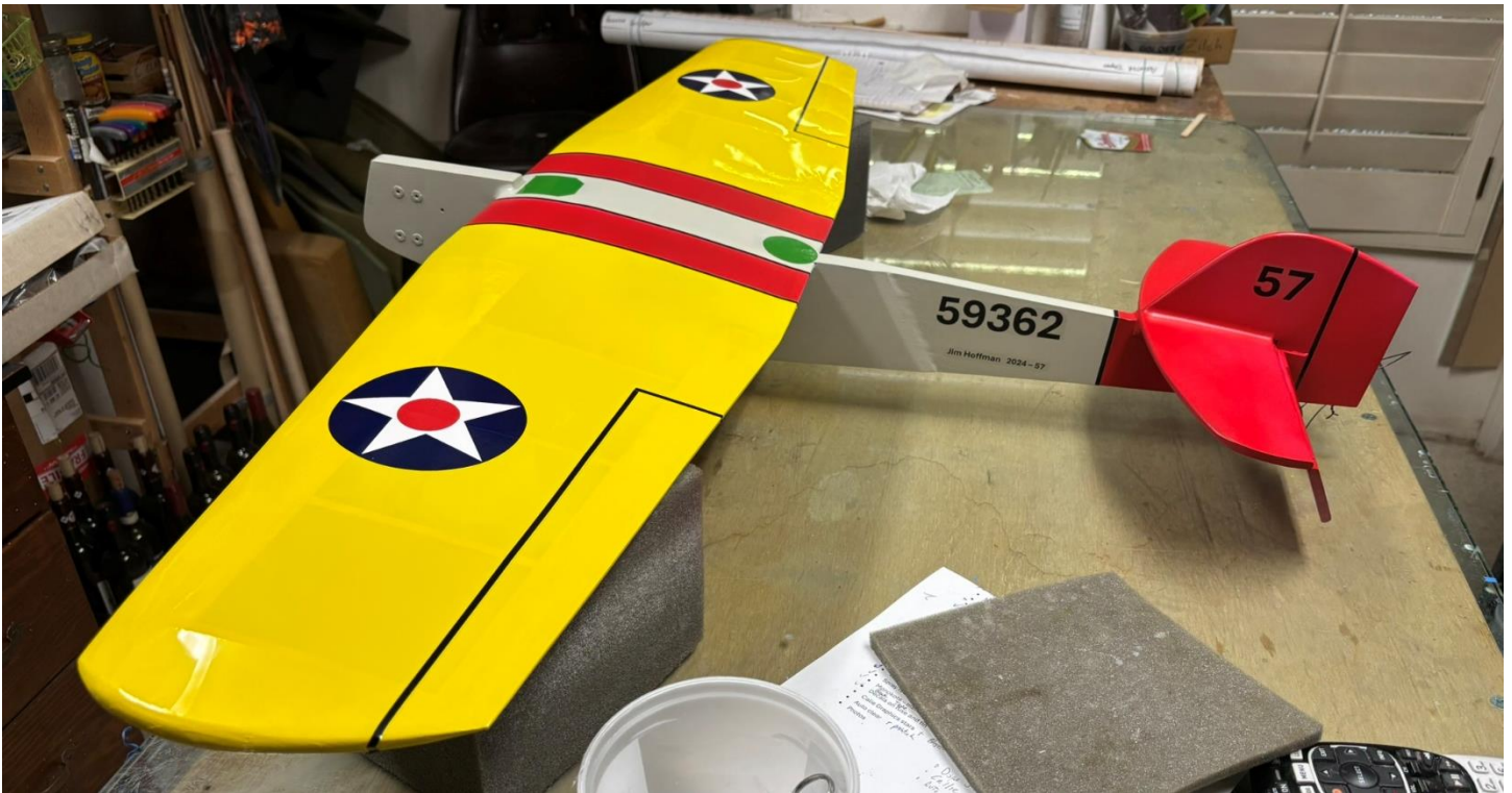
Jim's nearly finished MO-1 from the Golden State kit.