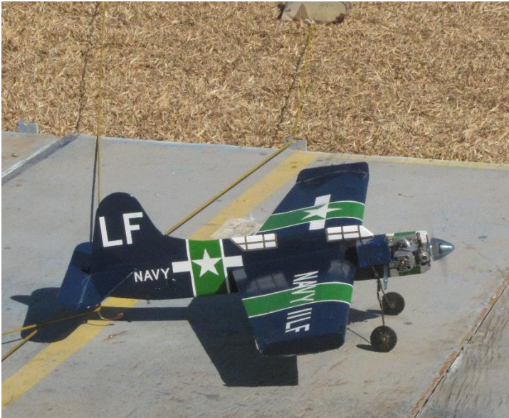
Lou Wolgast flew this Curtis Seagull in .15.