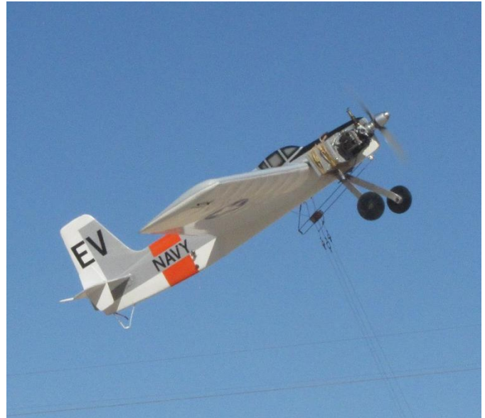
His Profile entry was this Grumman Giardian.