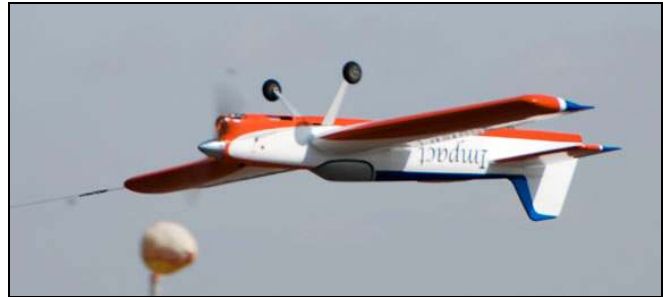
Rick Cochrun's Impact in inverted flight.