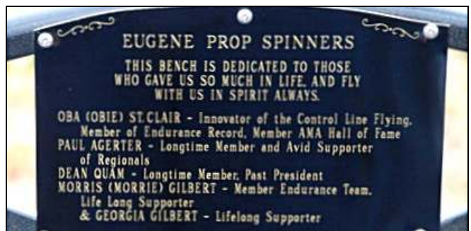
. Flying Lines photo.