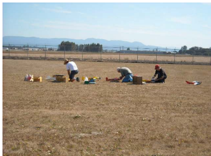
Three Mikes a fueling