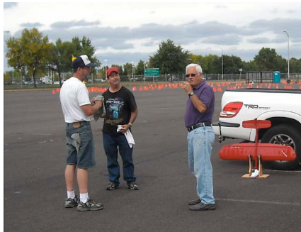
Three Mikes a talking