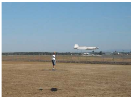
Mike Denlis looking good