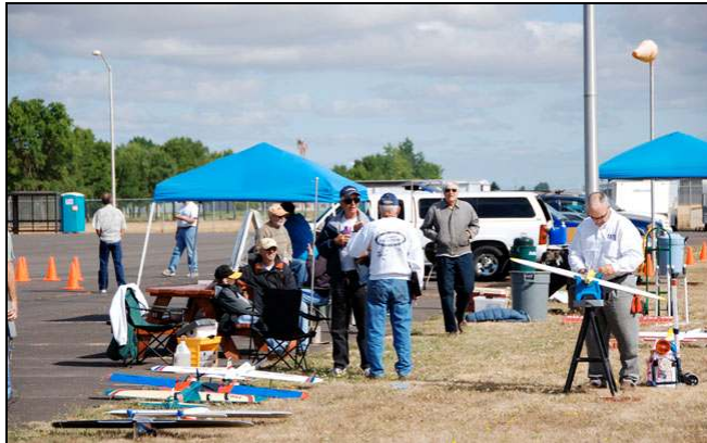
Busy pit area on Saturday. Note the wind sock, straight out!