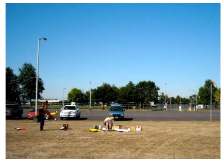
Hot, dry and NO WIND