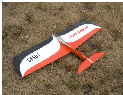
A CLEAN Flite Streak