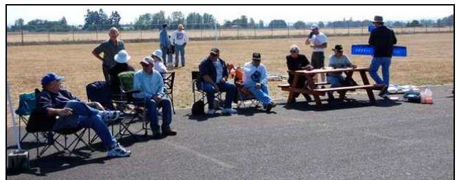
The new memorial bench and picnic table installed by the Prop Spinners earlier this year were in constant use throughout the contest. The bench is just visible on the left.