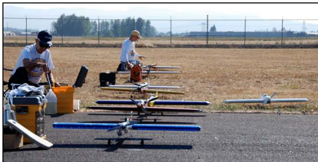
Precision Aerobatics planes in the pits on Sunday.