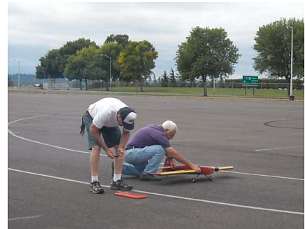
Where is the handle?