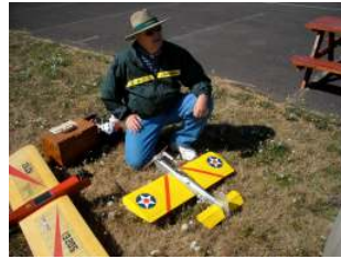
Ready to start