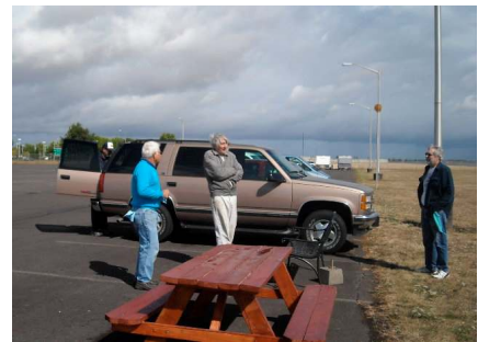
I flew, not me, not me...