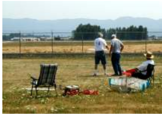
Then start it and FLY!