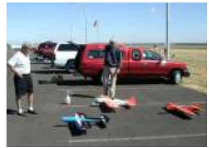
You fly first, no you fly first