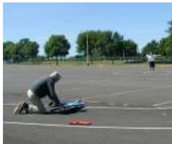
Let go NOW!