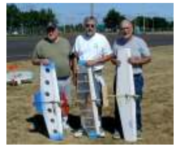
They are READY!