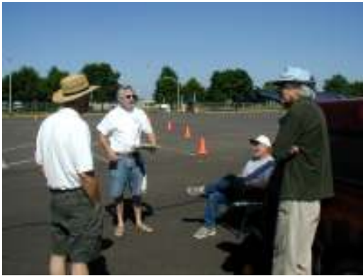
A brief meeting