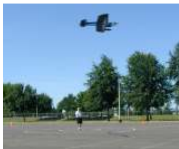
Tom coming in to land