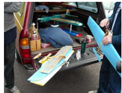
Vintage 1/2A combat collection.