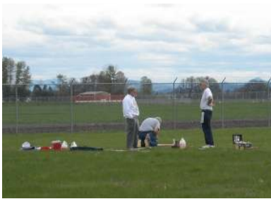
Needs a prop