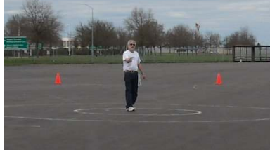
Evil still looks and sounds good.