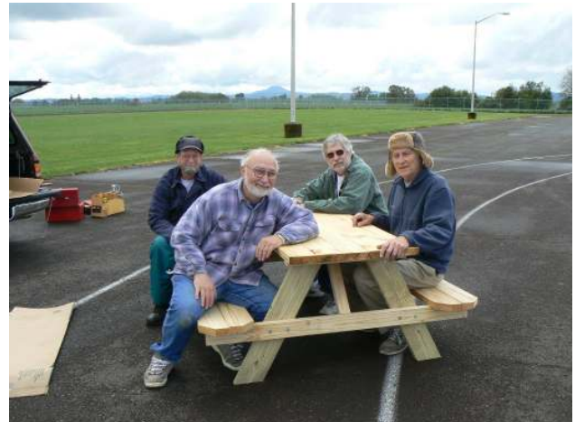
Testing was required also