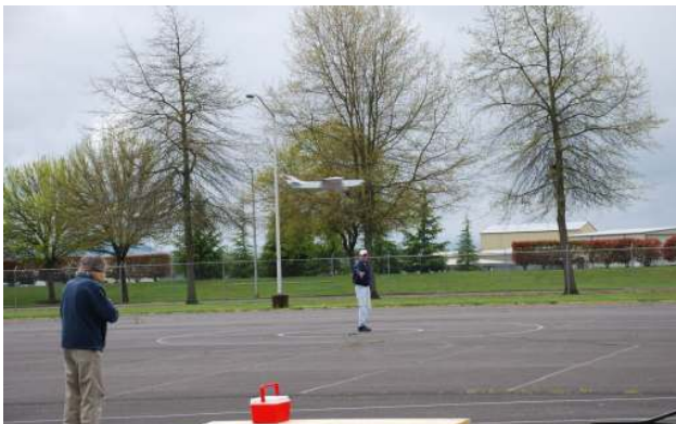
First flight looks good