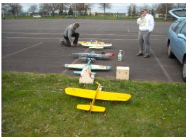
Open air hangar