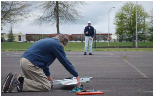
Ready to launch