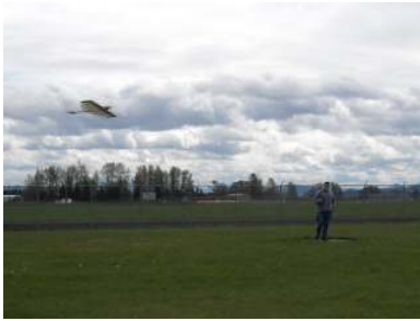
Combat engine testing