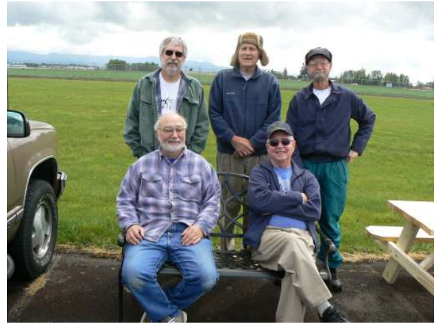
Assembly was required