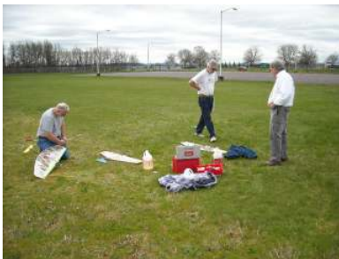
Lines help also