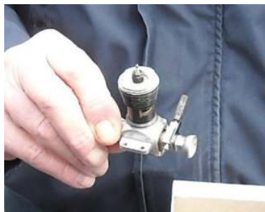
Cox Medallion .15