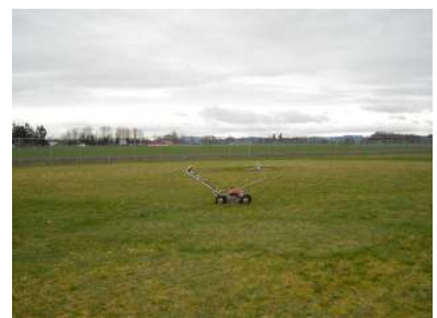
Takes just over an hour.