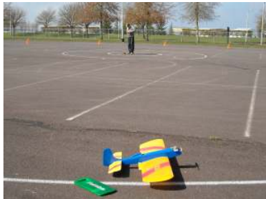
Floyd adjusting lines