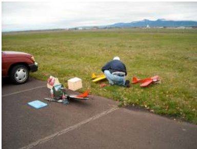
Fueling the two maidens.