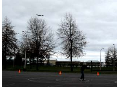
The one above the tree has no lines attached!