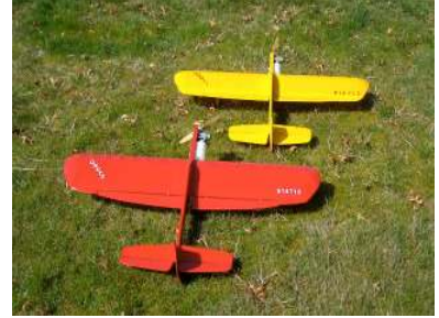
Soaking up the sunshine