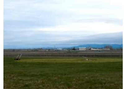
Two circles mowed with one tank of gas.