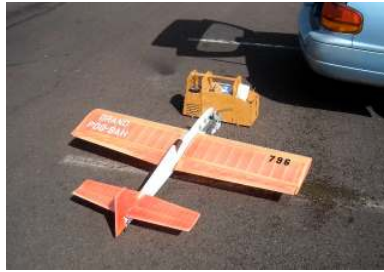
Grand Pooh-bah waiting