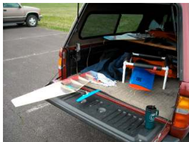
Full load and then some.