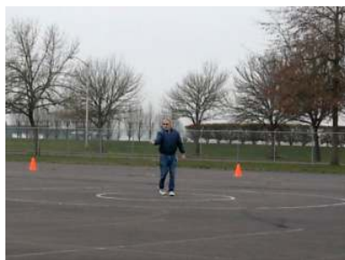
It is up there somewhere