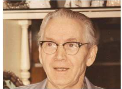
Oba in 1971