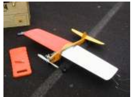
Here comes Big Red