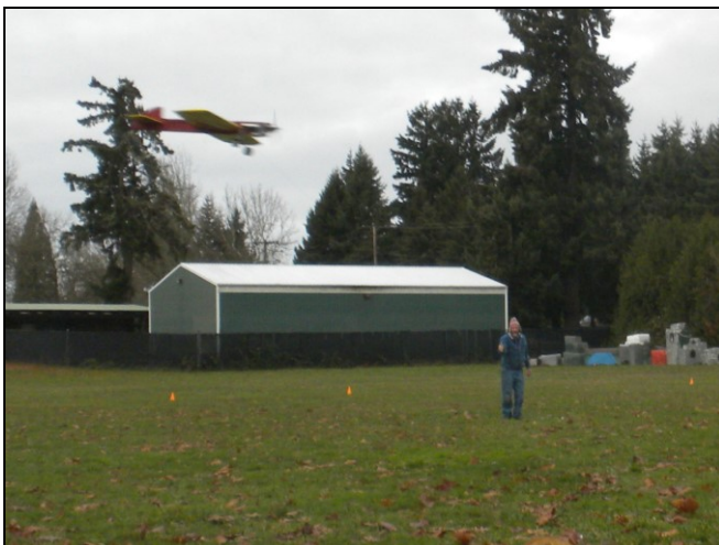
Gary making a landing approach