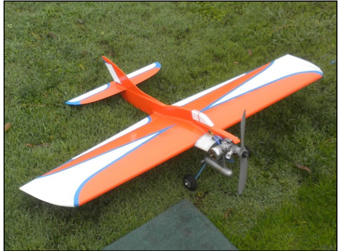
Gary's Flite Streak