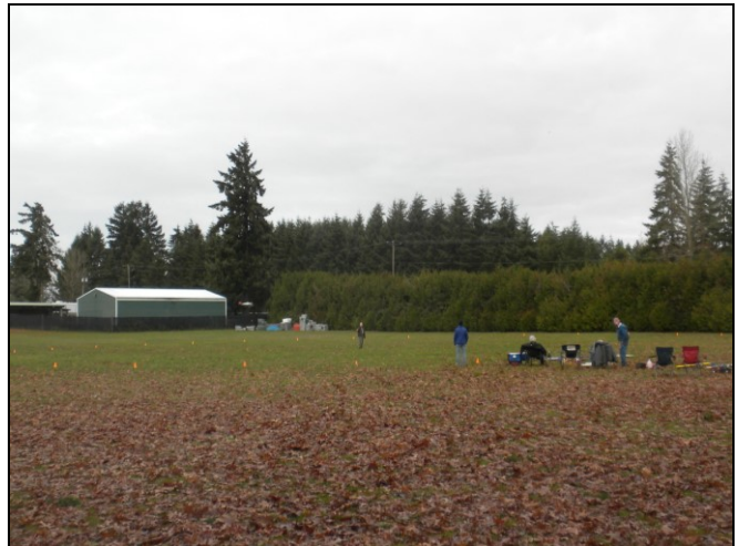
View of our flying area at Orchard Point Park