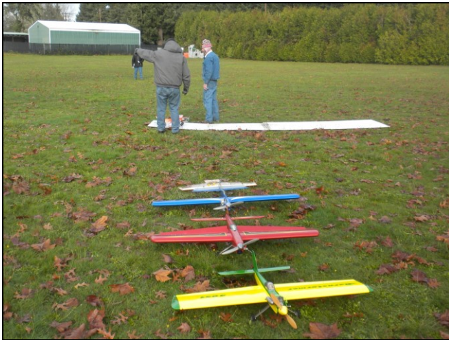
Pilots and planes about ready