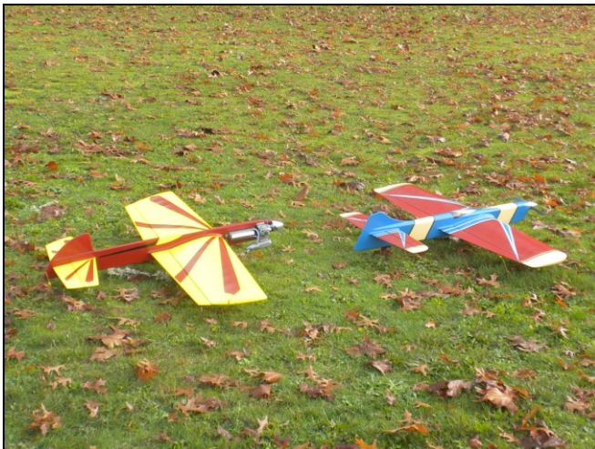
Two of Gary's planes ready