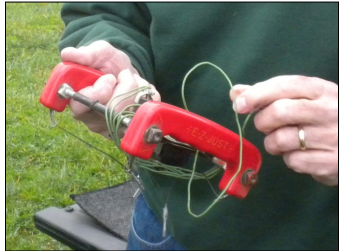
Show-and-tell of the two-pilot handle used in the Prop Spinners' famous 64-hour endurance flight in 1957