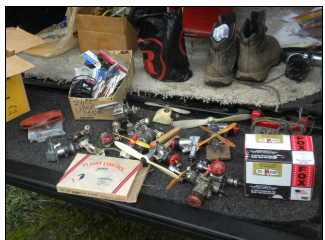
Motors, motors, motors