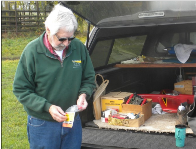
Many small items