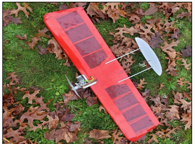
Stan's Nemesis with a Super Tigre G21 .35