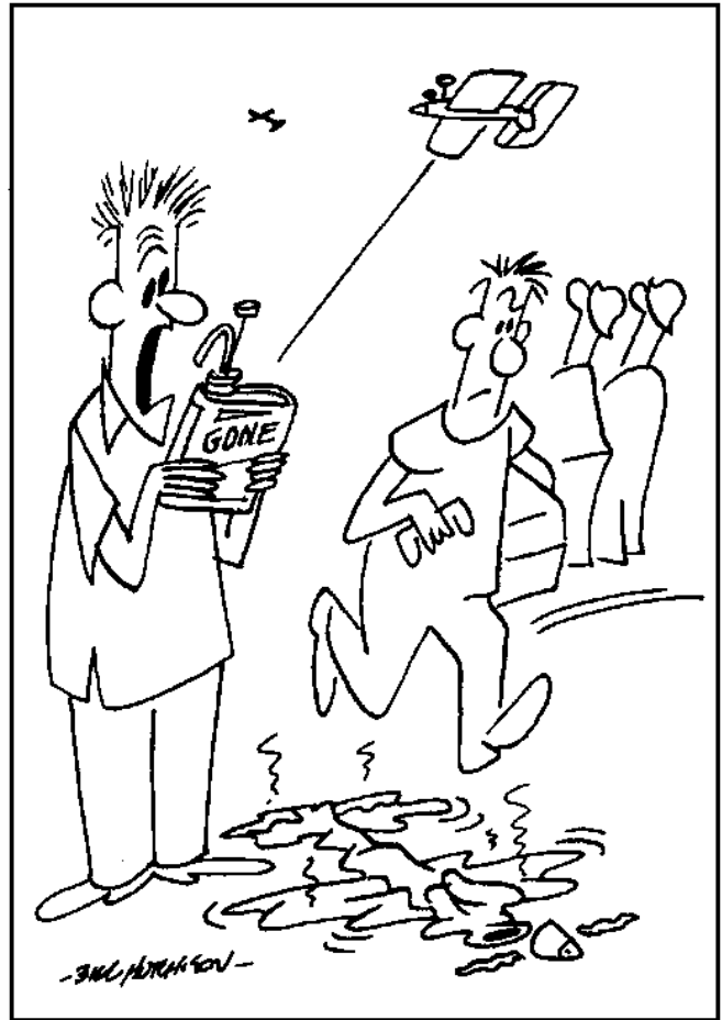
"Ingredients aren't listed!"