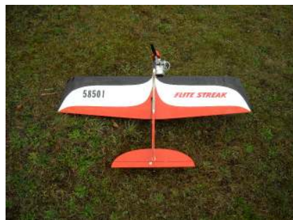
Black, White and Red.