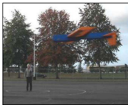
Appears top heavy now.