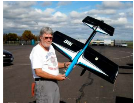
Tom's Show Stopper.