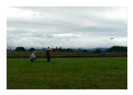
Christopher in training