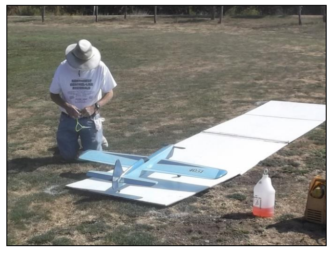
Lines being attached