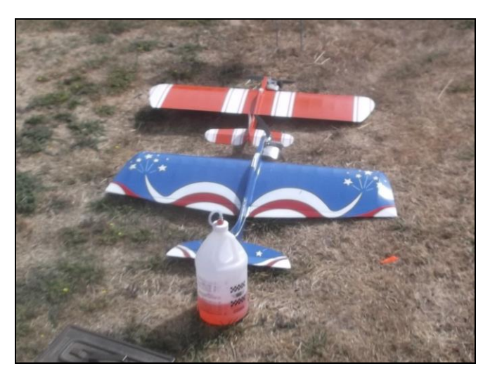
Have fuel, needs pilot