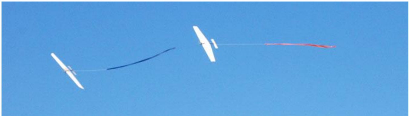
Combat action at the 35th annual Bladder Grabber.