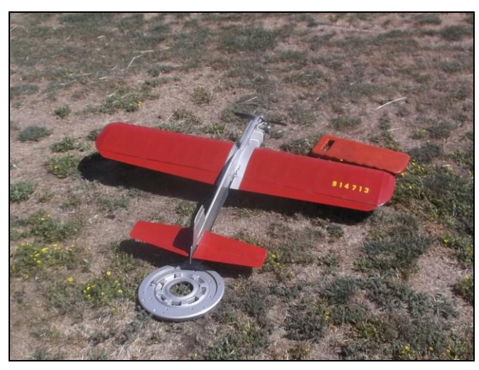
Mike's test accessory