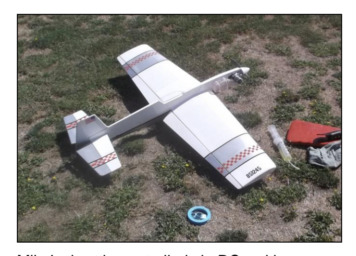
Mike's throttle controlled via RC waiting.