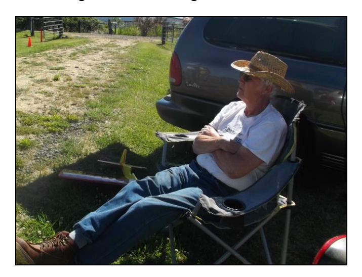
Gathering for the meeting