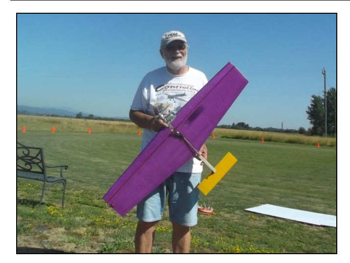
Gene's latest build