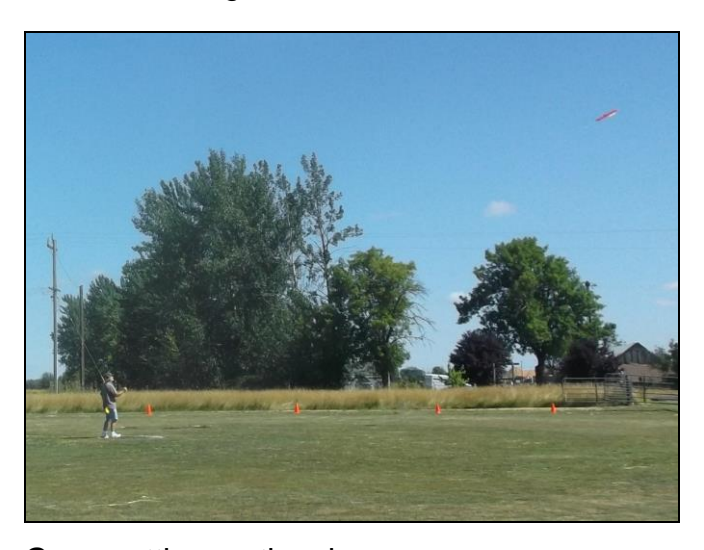
Gene cutting up the sky