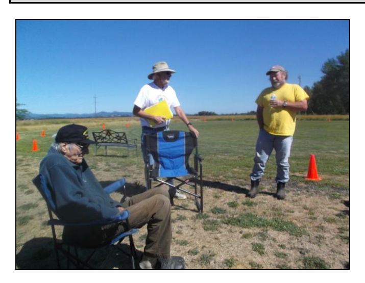
Gathering for the meeting