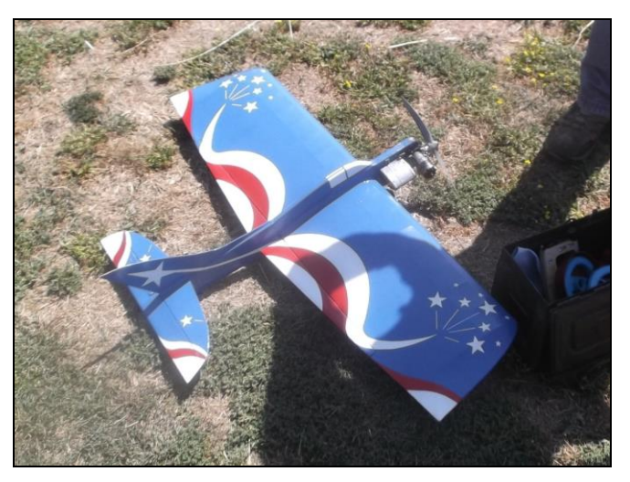
Gary's Flite Streak