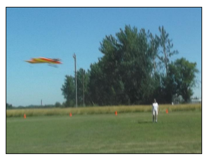
Lynette flying well