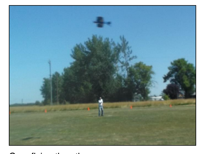
Gary flying the other way