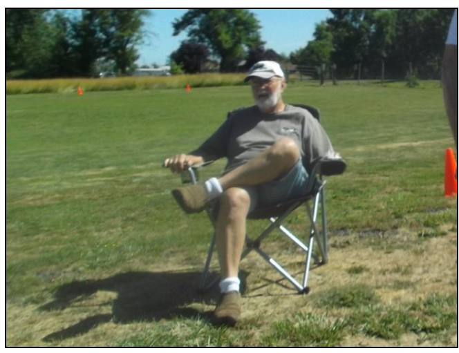
Gathering for the meeting