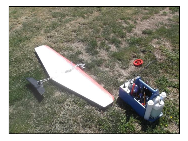
Russ's plane waiting