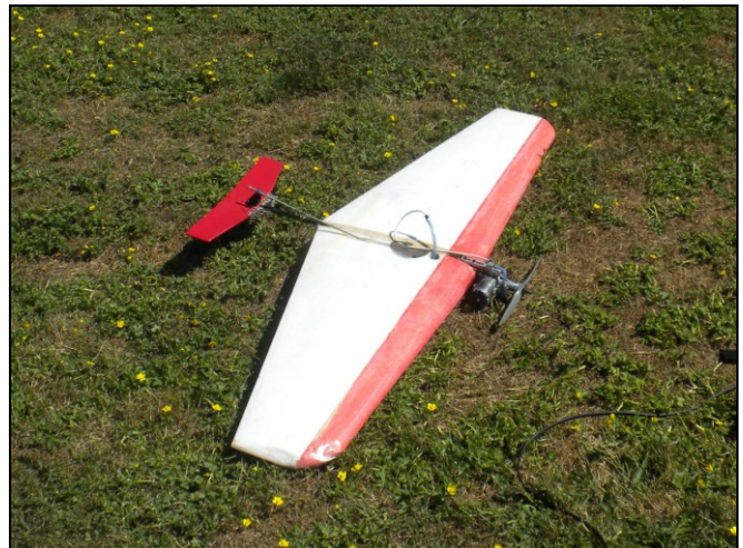
Russ's plane waiting