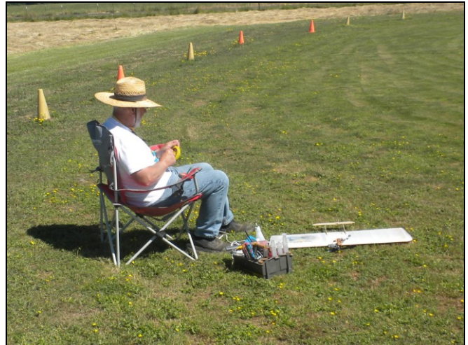
Gene rigging lines