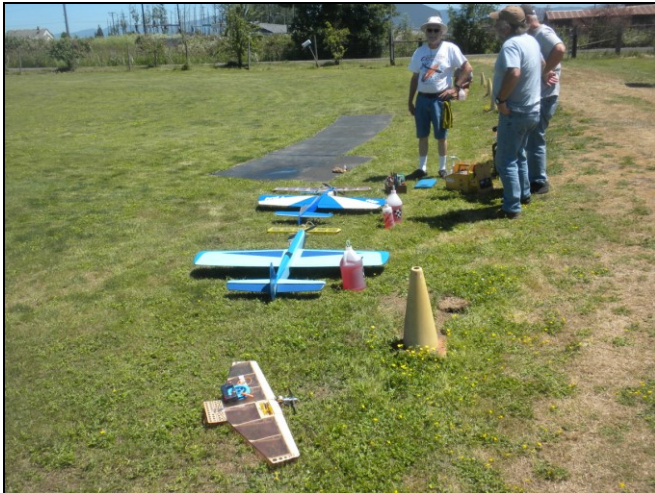
John's line up with spectators