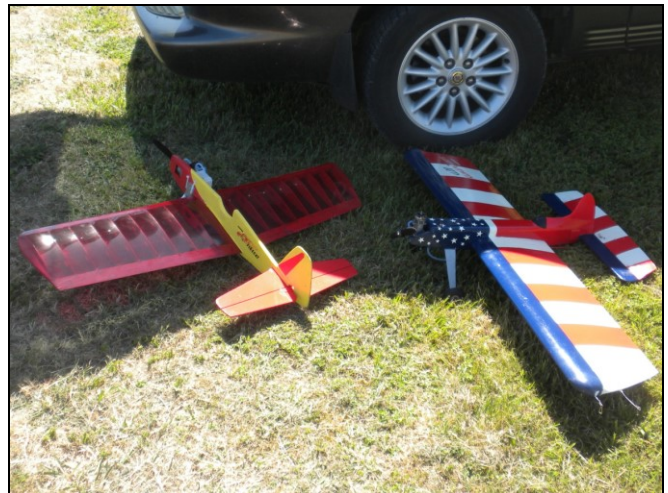
Two of Dave's planes