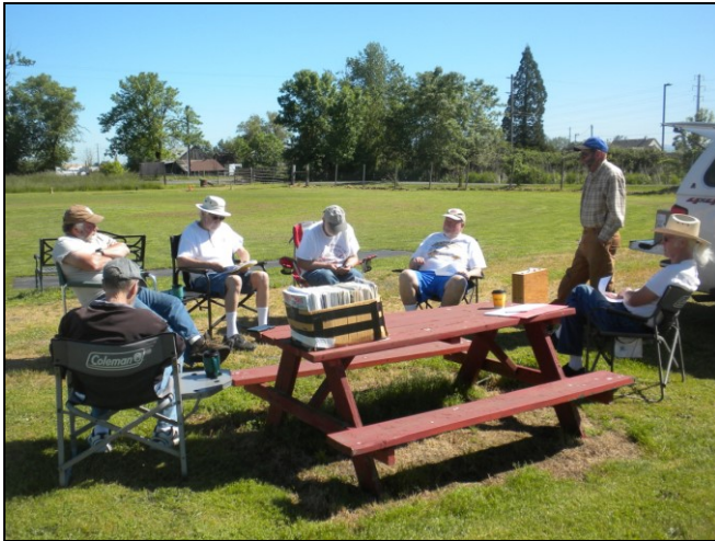
Meeting and chatting