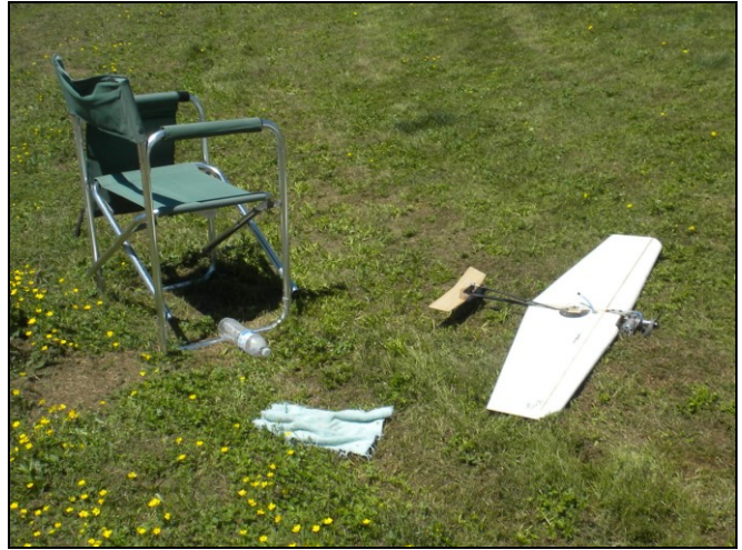
Plane ready, where is Russ?