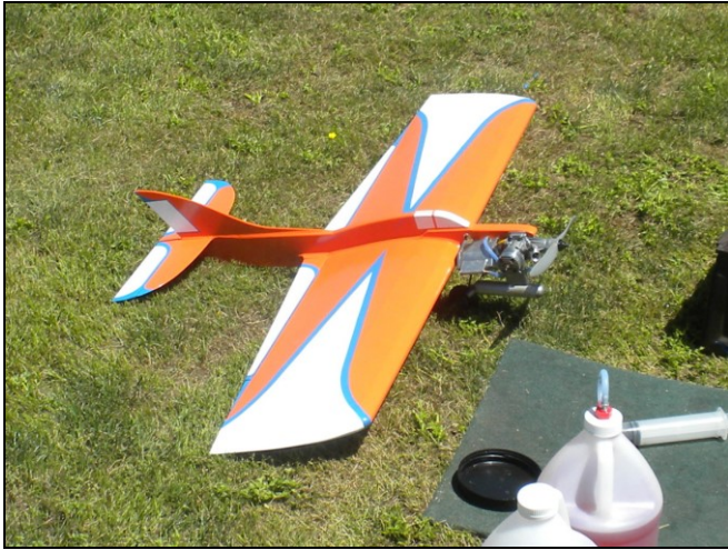
Gary's Flite Streak ready