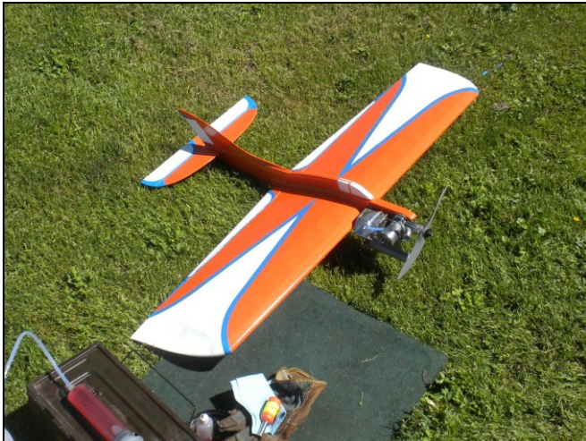
Gary's Flite Streak