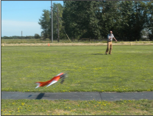
Gary taking off