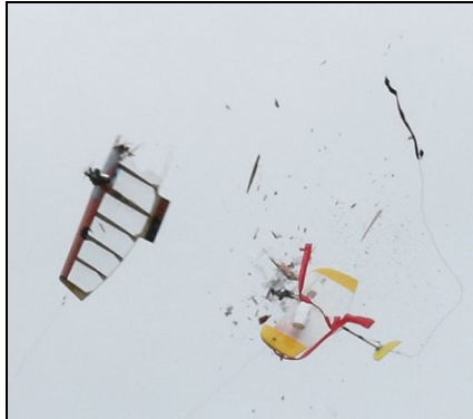
Collisions are part of Combat.

Sunday morning's Regionals highlight is Precision Aerobatics appearance judging.