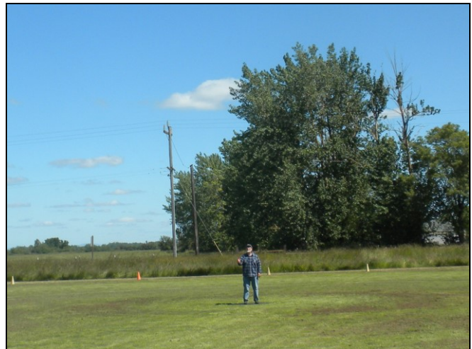
Gene flying fast