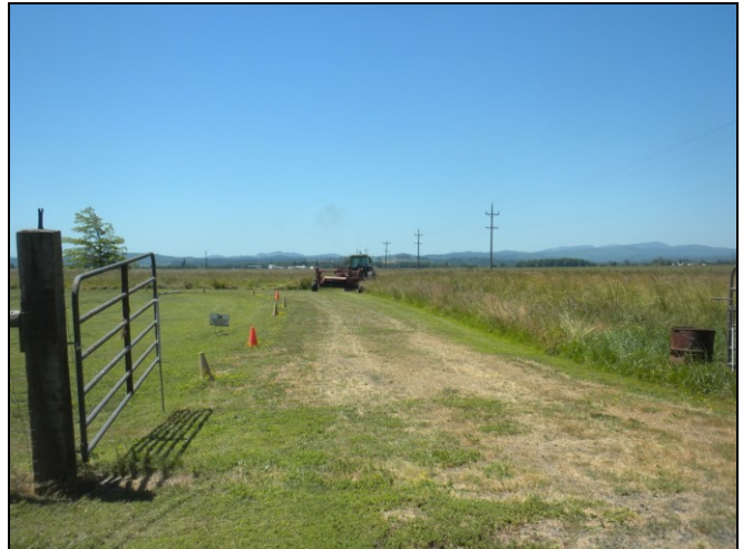
Field about to get mowed