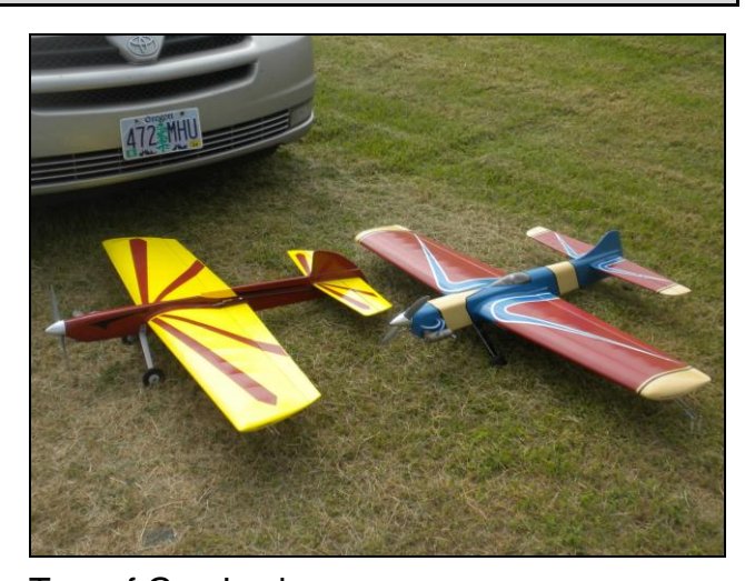
Two of Gary's planes