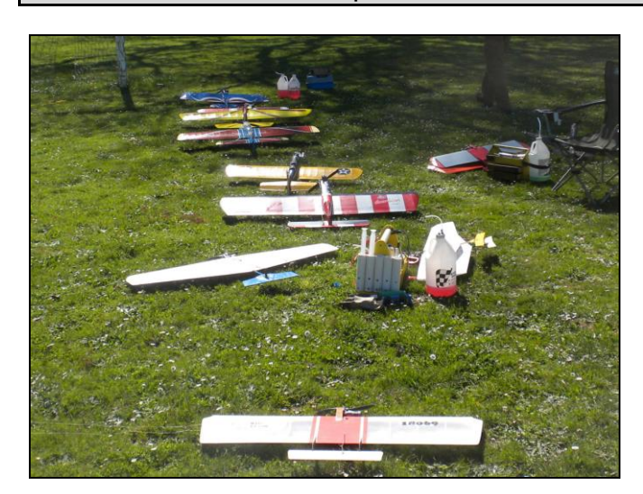
Waiting for pilots