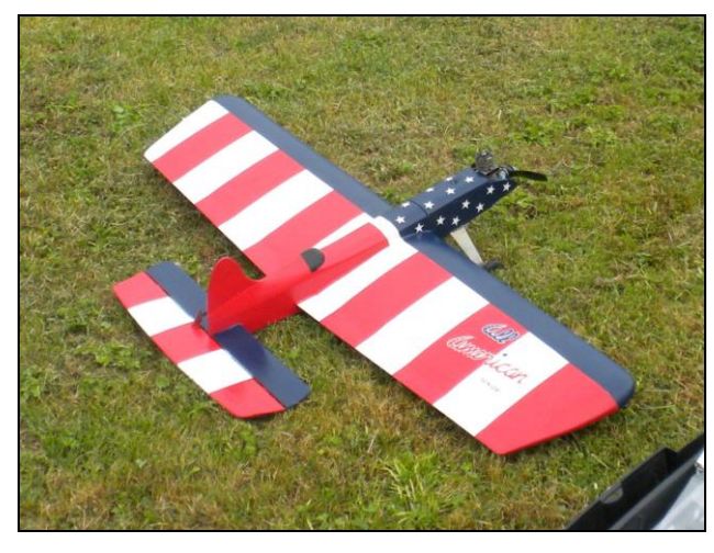
Dave's plane waiting