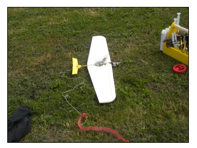
Russ's combat plane