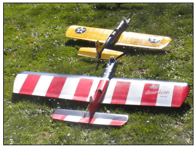
Two of Dave's planes