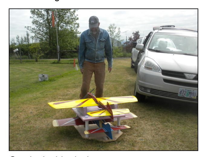
Gary's double decker transporter