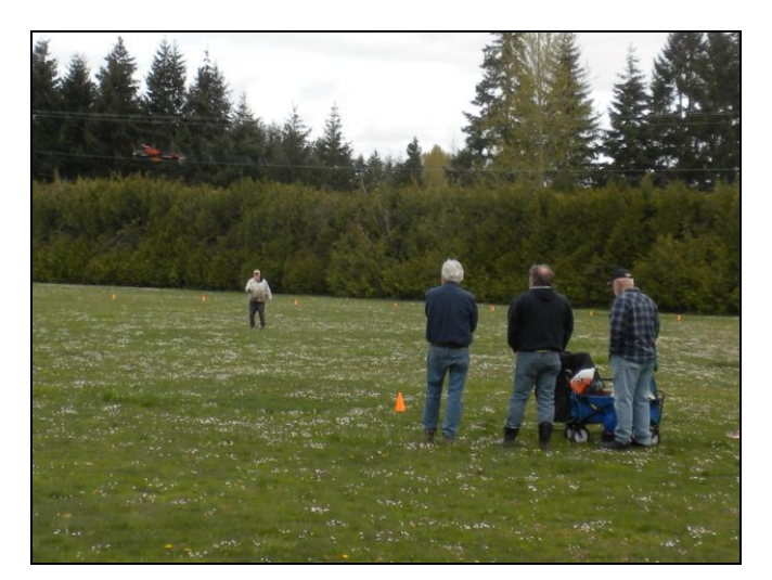
Backward flying draws spectators