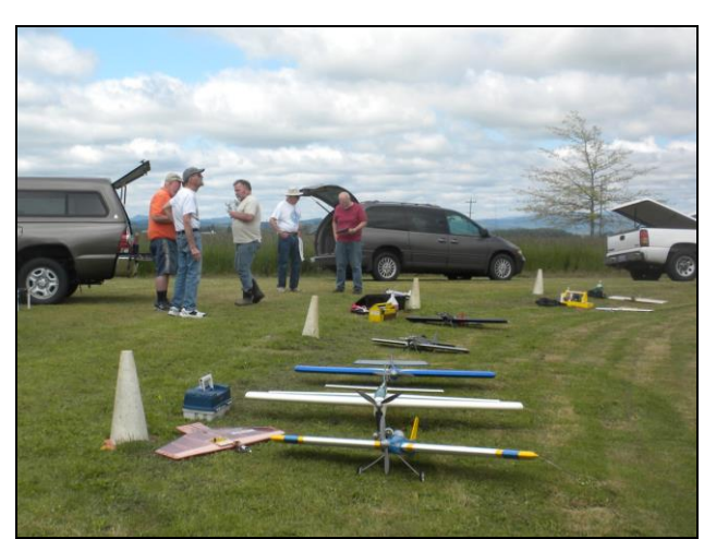
People and planes