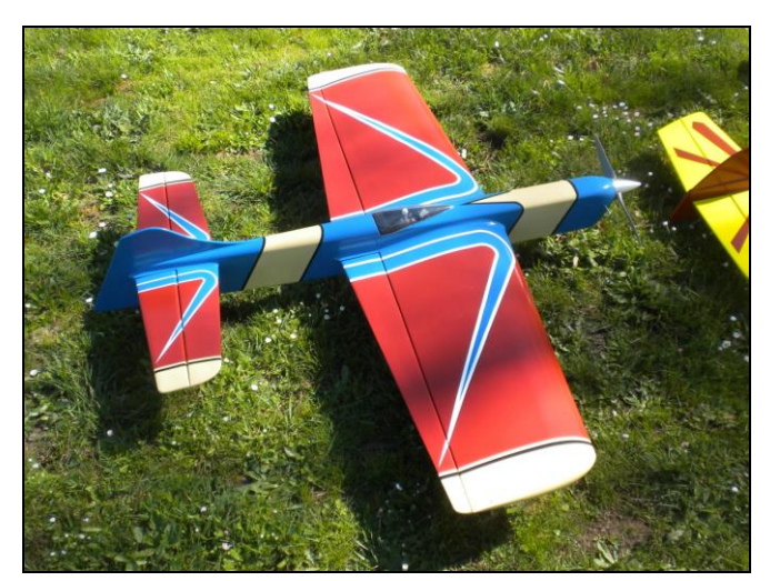
Gary's Vector 40