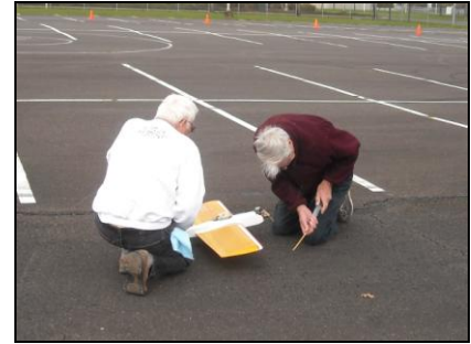
Needs just a drop more fuel