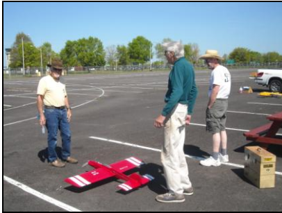
It's a wing \ fuselage thing