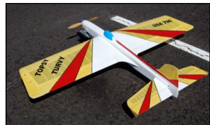
Floyd's Topsy Turvy