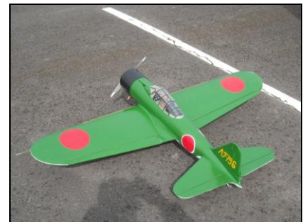
Floyd's Zero looks good in the air too