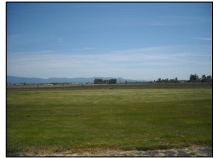
Carrier circle mowed