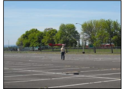
Can't catch it's shadow