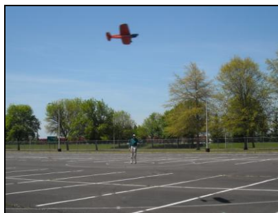
Floyd's Highboy in the air