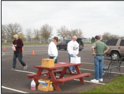
Meeting business conducted