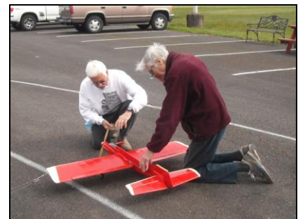
One more flip