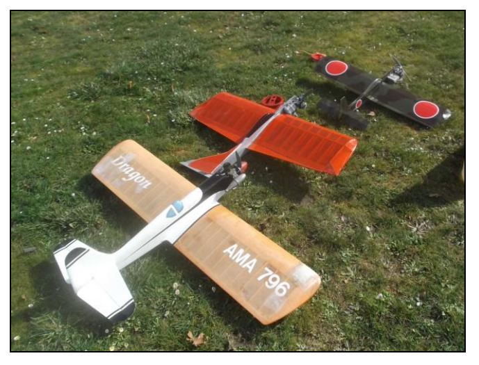
Dave has three ready to fly