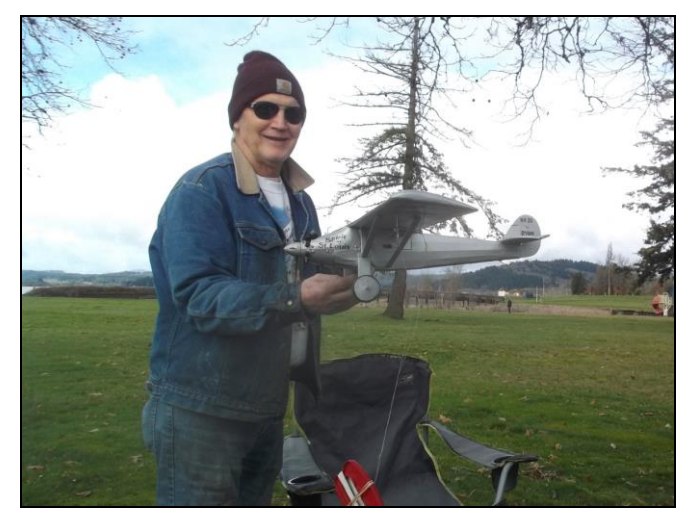
Show and Tell - Better view of both