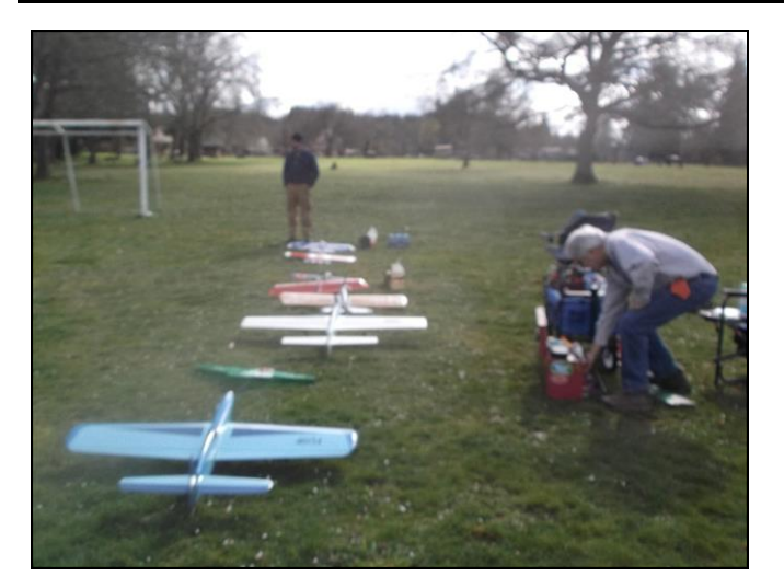
Lined up and waiting