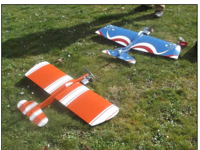
Gary's got two ready to fly