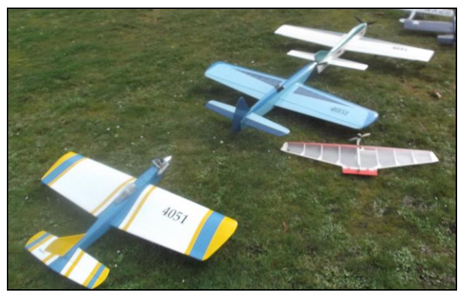
Ready to fly

Flying at Orchard Point Park - February 27