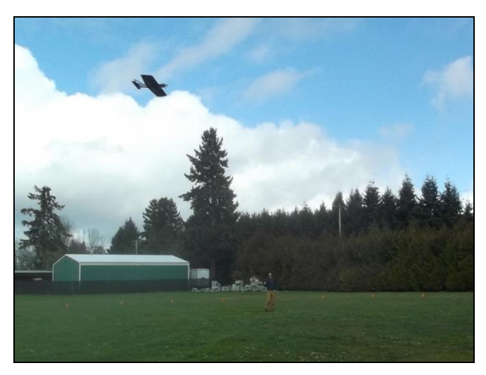
Gary in the air