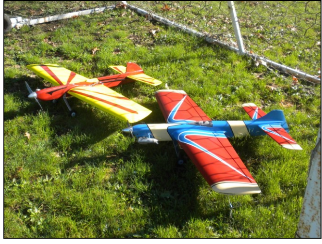
Two of Gary's planes