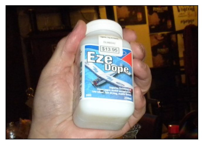
Water based dope