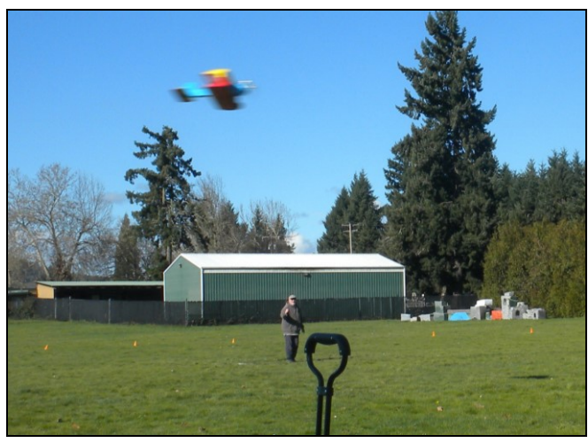
Mike's maiden flight of the Big Slob