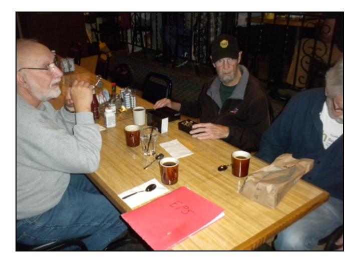
Meeting has begun