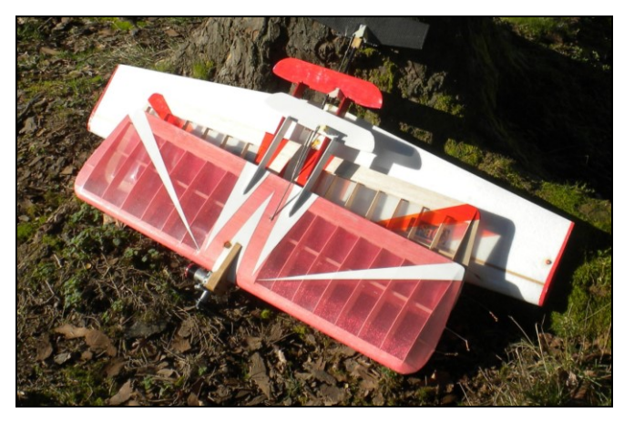
Waiting to fly