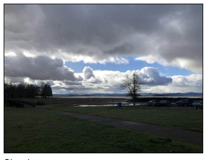
Sky shot