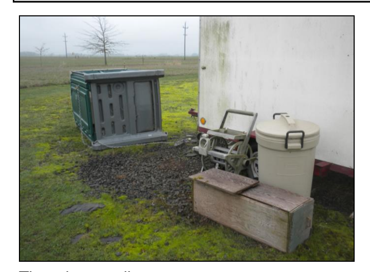
Tipped over toilet