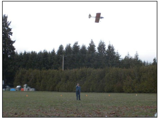
Dave making a landing approach