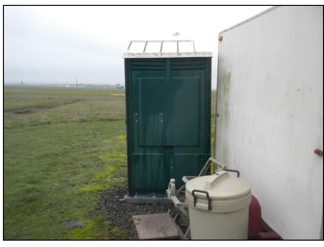
Back right side up