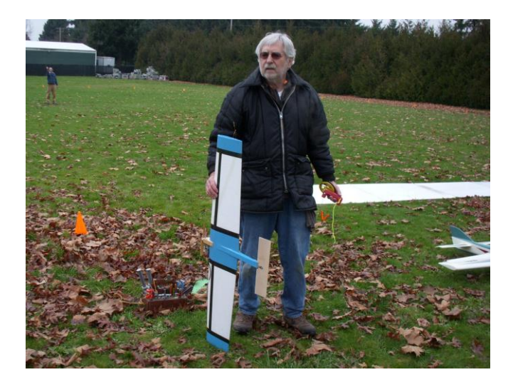
About to be fueled

Orchard Point - January 22 - - continued