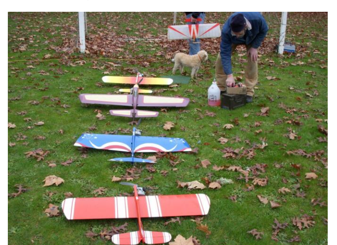
Gary's planes waiting