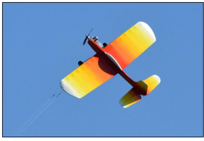
Gary Weems's Tomahawk in a wing-over