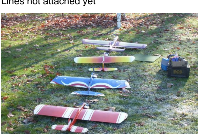
Gary has several ready to go up