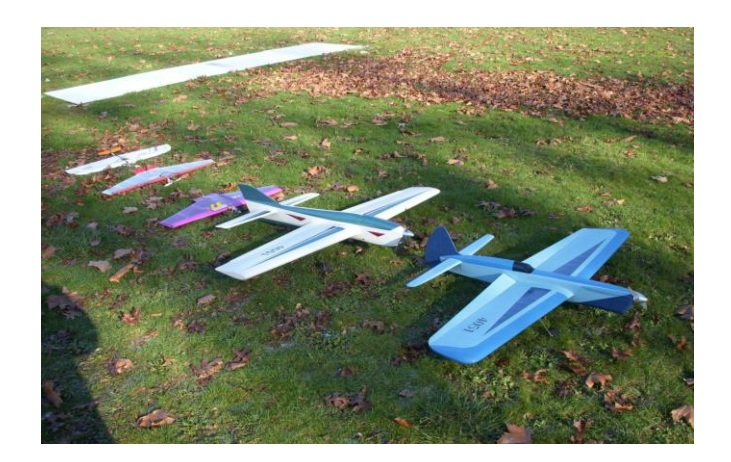
Lines not attached yet