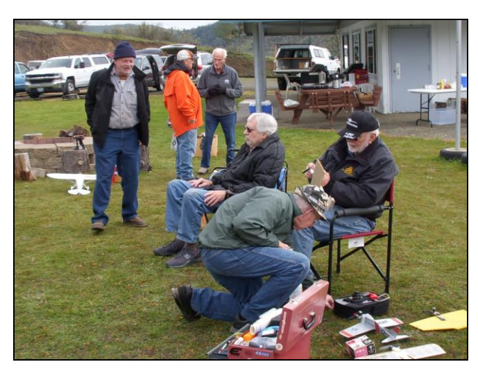
Planes waiting to fly