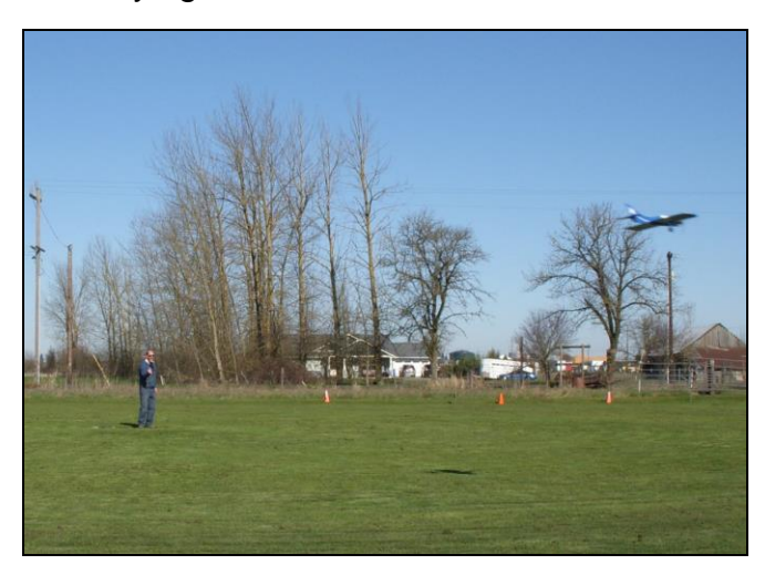
Gary making a landing approach