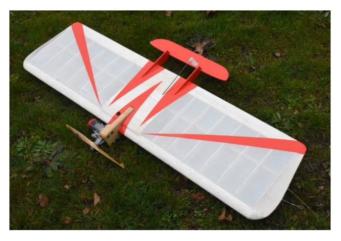
This is Gene's new VooDoo, finished with laminating film over silk, powered by Fox Rocket.