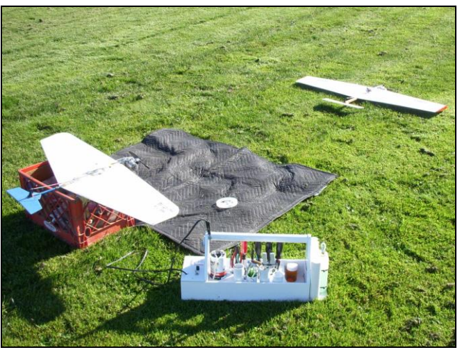
Russ's plane ready