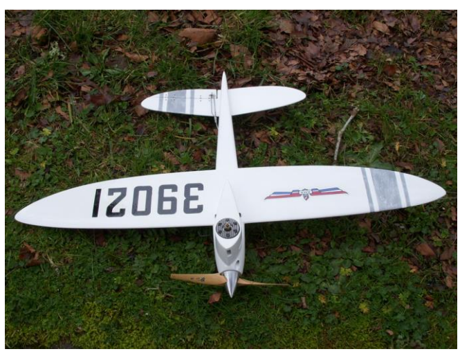
The Show and tell plane