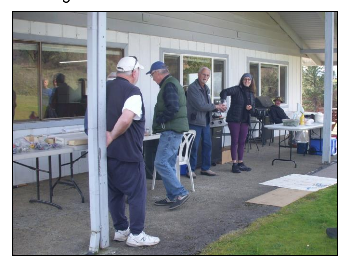
And a winner