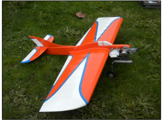
Gary's NEW Flite Streak