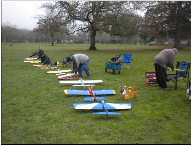
Planes lined up and ready