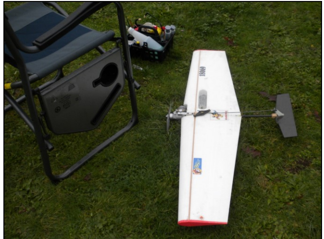
Gene's plane waiting for lines