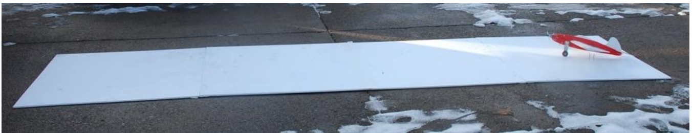
Folds up and fits in his van.