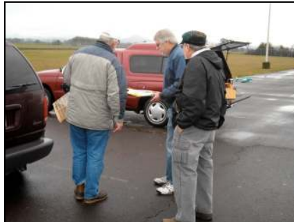
It has flown a time or two.