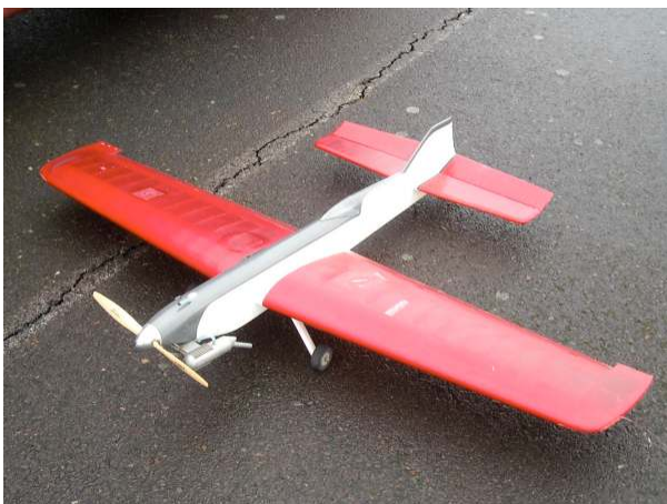
Trivial Pursuit - OS Max 46 sf