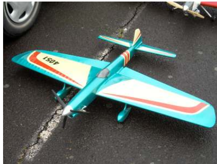
This still looks good!