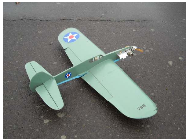
P-40 Profile – OS Max 40 fp