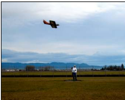
That's the way!