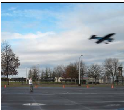
Shirt sleeve weather flying