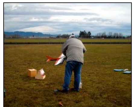
Gene ready to streak the field