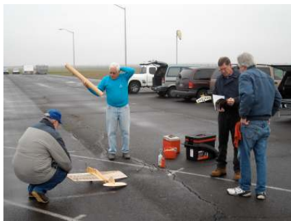
Hook up the lines...