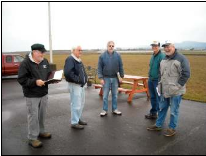
It's a meeting.