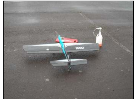
On the ground.