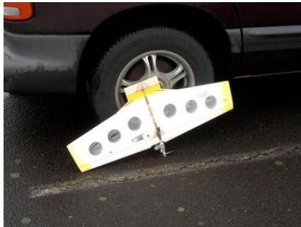
Normal angle of attack ?