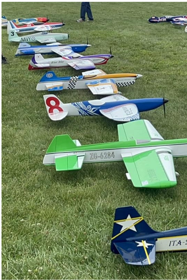
Some of the 47 F2B models flown at the World Championships.