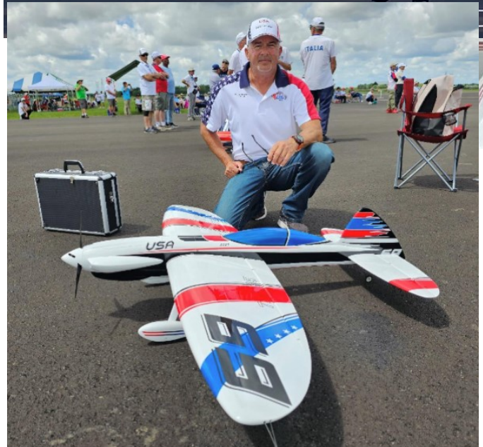
Former world champ Orestes Hernandez (USA) just missed winning it all by a mere half point!