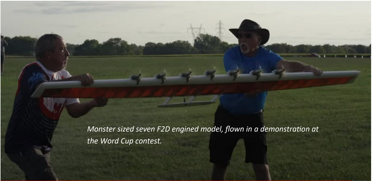
Monster sized seven F2D engined model, flown in a demonstration at the Word Cup contest.