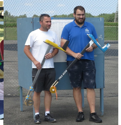
Speed pictures from Fred Cronenwett