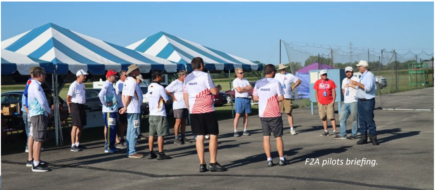
F2A pilots briefing.