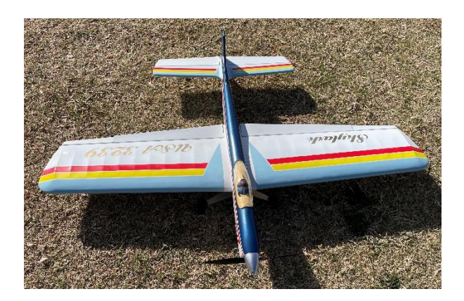
Stan Tyler's Skylark