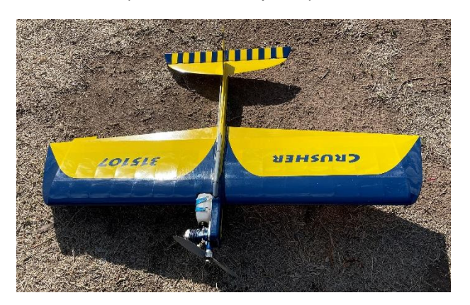
Grady Widener's Flite Streak