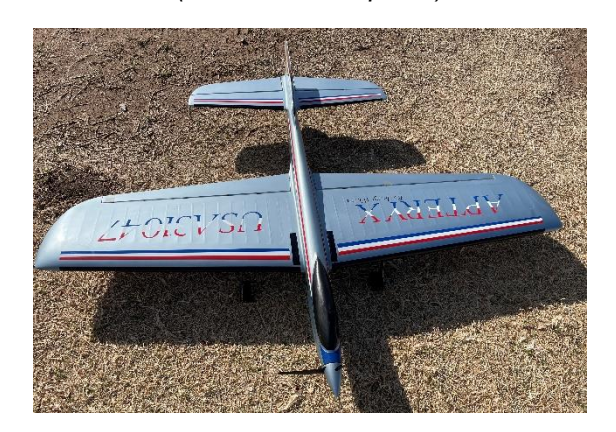
Jim Rhoades' Apteryx