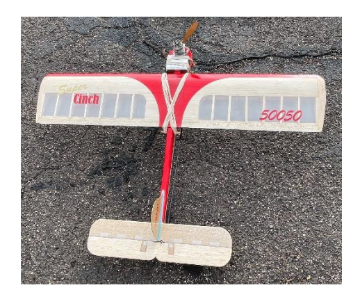
Jim Lee's Super Cinch