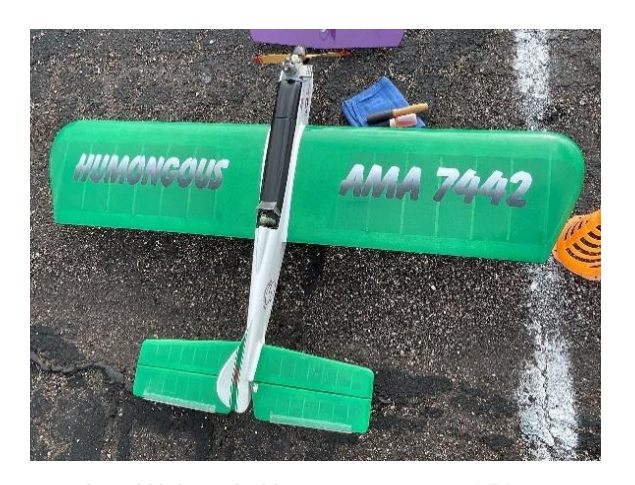
Lou Wolgast's Humongous – 2nd Place