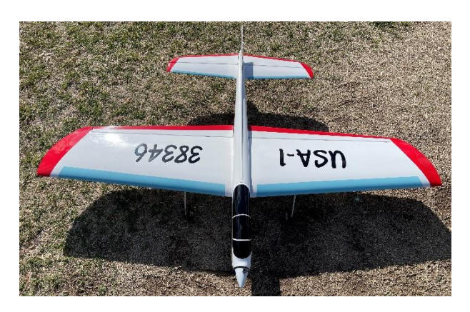
Page Peterson's USA-1