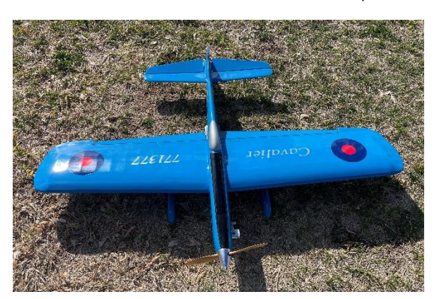
Joe Gilbert's Cavalier – 2<sup>nd</sup> Place