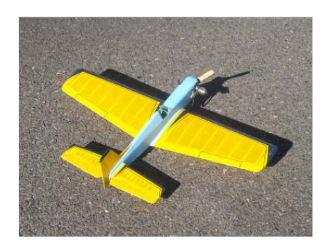
Floyd's Millsbomb diesel