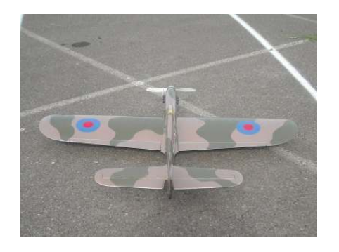
Floyd Carter's Hurricane