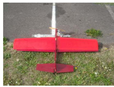
Still waiting to fly