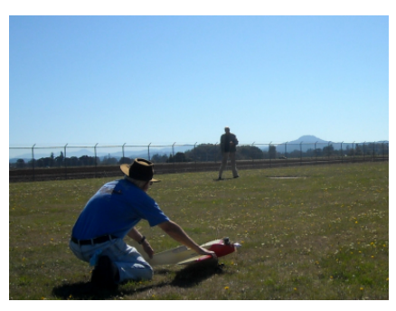
Madman ready for long awaited launch