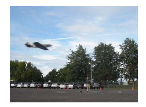
And in the air!