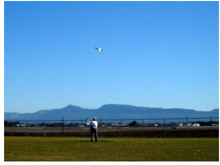
Tom Kropiva flying