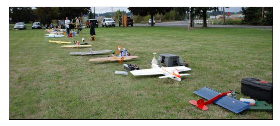
Sunday Precision Aerobatics pits from the back of the line.

Turnout was good, with 28 contestants making 94 official flights over the two days. The lineup of planes in the pits was impressive to the spectators who dropped by the field.