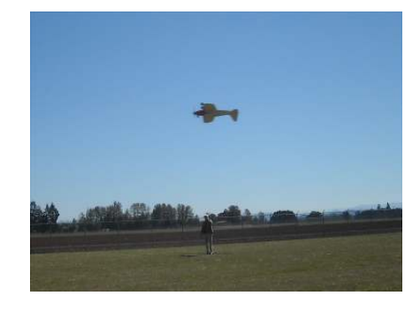
Floyd wasted no time going inverted