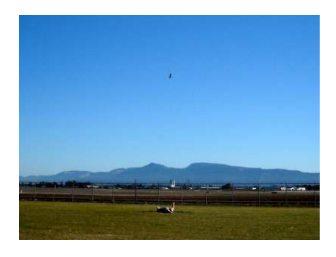
Gene relaxes while flying