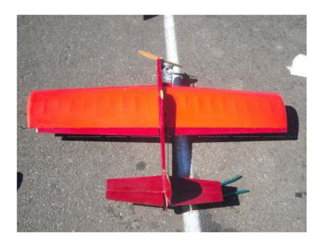
Red and Ready