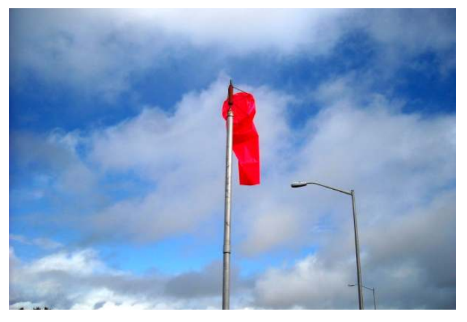
Wind was near calm, but variable when there.