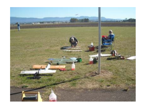
Grass hanger and pilot prepping their craft