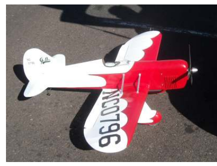
Floyd Carter's Gee Bee