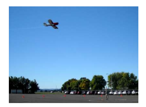
Gee Bee flies