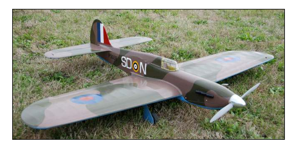
Floyd Carter's original design Hurricane, powered by Ro-Jett .61.