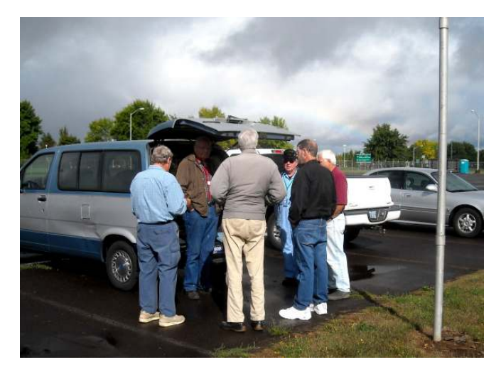
Meeting a bit misty.