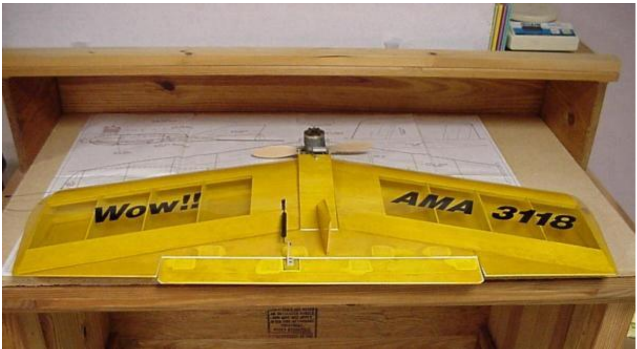
In 1956 Consolidated was offering the "Wow" as their combat ship of choice