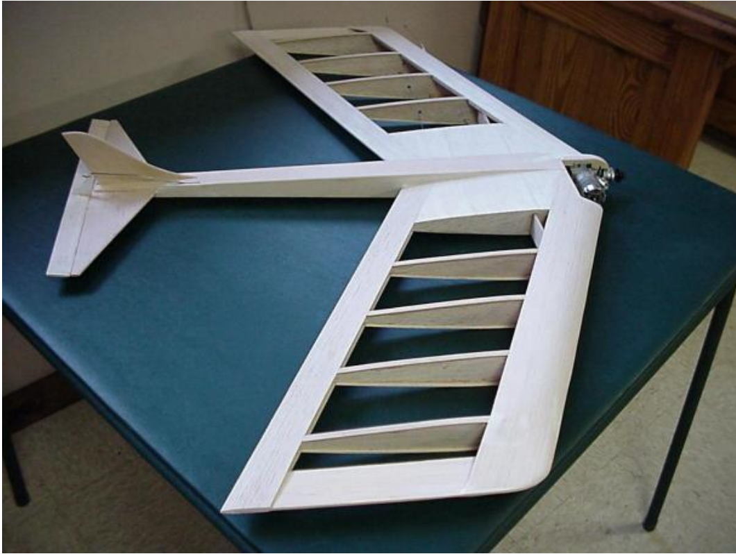
A Sweet Sweep bare bones built from Barry Baxter plans