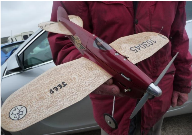
Another gorgeous Vintage 1/2A model built by Ken Newbold.