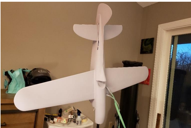
And now, ready for paint.

I am still plodding along on my Good News for VBT/R, she's in primer now and being sanded! Speaking of primer, I have some thoughts on Rustoleum 2-in-1 Filler & Sandable primer, but I'll boil it down to don't bother using it. Typically I use KlassKote primer or Duplicolor in a pinch, but I was out of both, and I needed to get going on this thing, so I decided to give this Rustoleum stuff a shot. Wow, does it clog paper. I tried wet and dry, three different grits, and three different types of abrasive, and it was a total joke to sand. The only way I have figured out how to sand it is to wet sand with 220 grit until you are about 75%-80% of the way there, and then switch over to 500 or 600 wet for the last little bit. I'm not a super huge fan of being that aggressive to start with paint, but the product is apparently aimed at people who don't know any better. Typically the coarsest I'll go with a primer is 320, but that's just me. It's also an insanely high solids primer, and at least with the 220, will start making massive amounts of mud pretty quick!