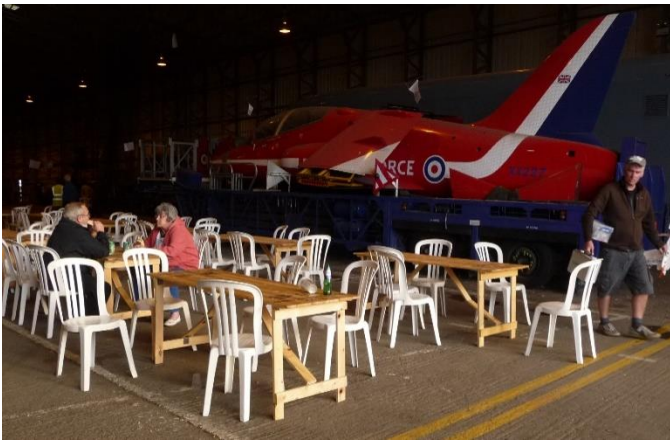
The Nats beer tent was packed every evening where modellers gathered to tell outrageous stories. Great fun!