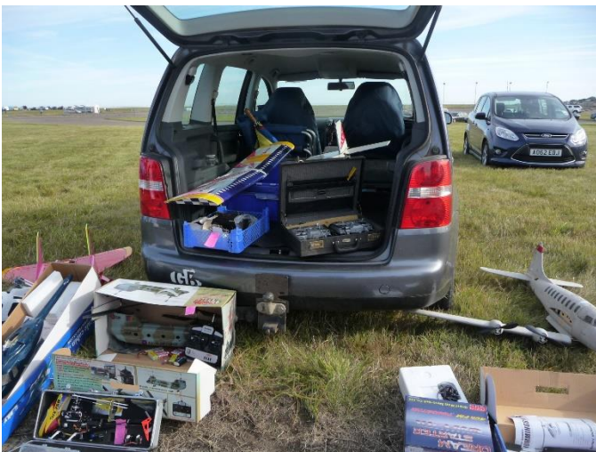
Just one of about 200 vehicles at the "British Boot Sale" swap meet on site. One can find most anything from vintage C/L, F/F, R/C to a myriad of collectable engines, books & magazines. Vendors are from all over Europe.