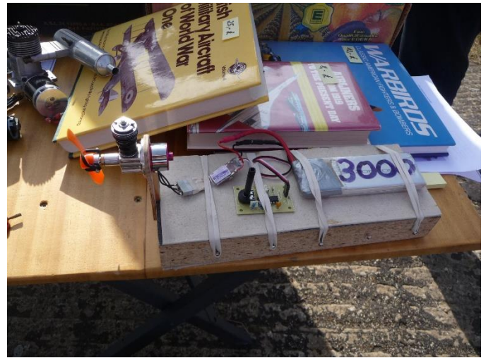
A rather clever fellow from Germany displayed his Cox .049 converted to electric. Electric Mouse race anyone?