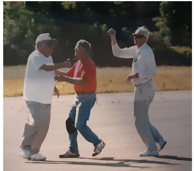
This looks like fun; I think it would pass for F2C flying.