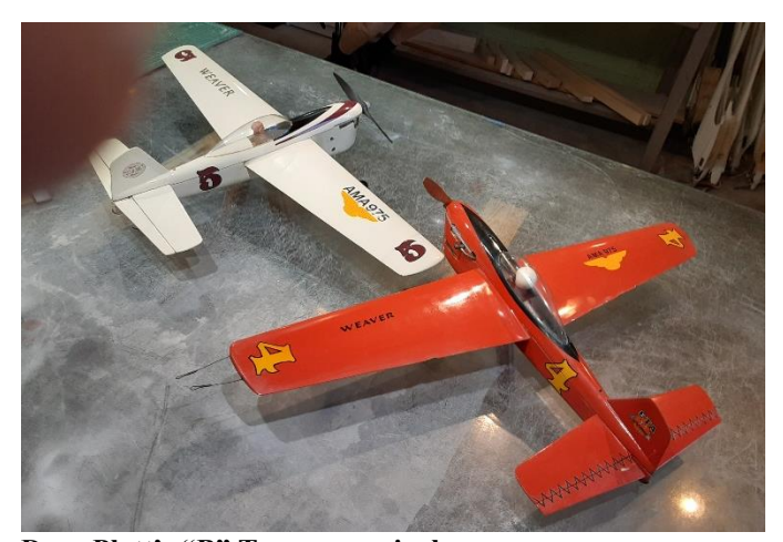
Dave Platt's "B" Team race airplanes.