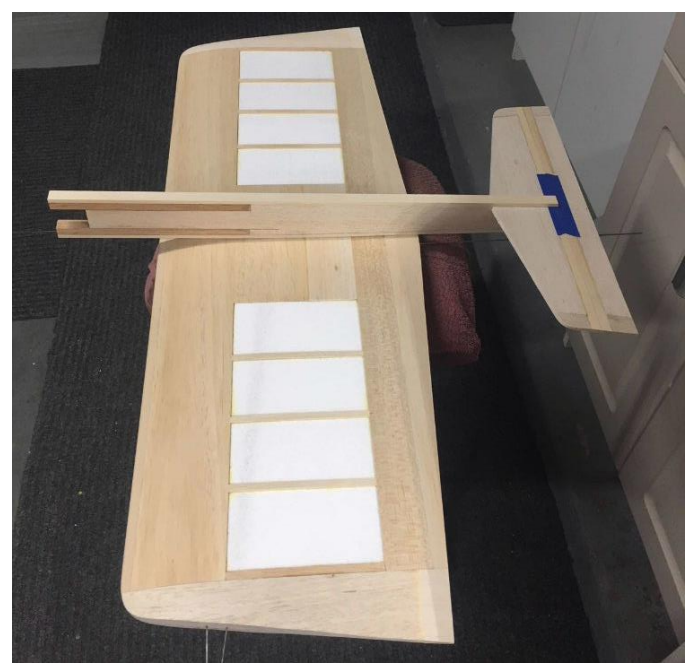
Kelly Hite's new SSR, uses an older Bischoff Slow Rat foam core wing. Looks good!

I've also been working on some things myself. Mike Greb and I have been travelling to the NATS together for years. We have packed models in many different, sometimes precarious, manners. Now that we are both concentrating on racing only, the task has gotten somewhat easier. Our current scheme involves a layer of tool boxes, suitcases, fuel cartons, and other miscellania in the back of the van, with the model boxes stacked on top. The cardboard boxes I had been using as airplane racks weren't very durable, especially when they got rained on.