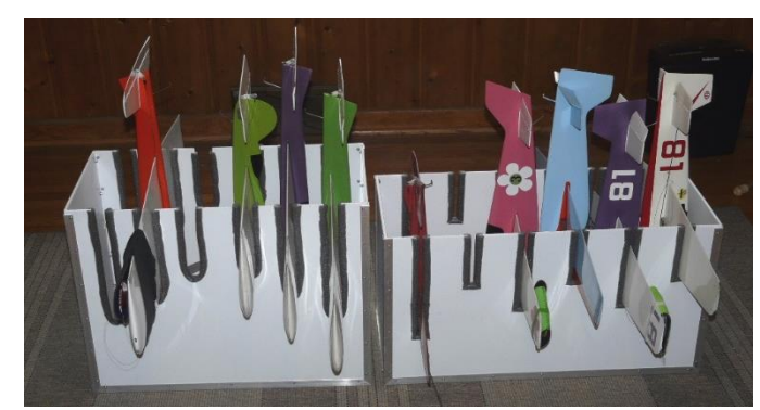
(Above) Bill Bischoff's new Model Transport Boxes, see text for details.

I've also been working on some things myself. Mike Greb and I have been travelling to the NATS together for years. We have packed models in many different, sometimes precarious, manners. Now that we are both concentrating on racing only, the task has gotten somewhat easier. Our current scheme involves a layer of tool boxes, suitcases, fuel cartons, and other miscellania in the back of the van, with the model boxes stacked on top. The cardboard boxes I had been using as airplane racks weren't very durable, especially when they got rained on.