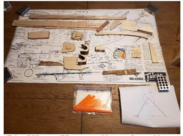
"Falcão" Vintage "B" team race kit, manufactured in Brazil, see text for details.

On a side note, it also turns out there is a kit manufacturer for Vintage B Team! They are out of Brazil and produce a very complete kit of the "Falcão"! Included in the kit are even a tank, hardware, lead-outs, shut-off, and a couple of plastic alignment triangles/contour gages! It is all laser cut, and I really can't wait to build it. This particular design is intended for front rotor engines such as Enya, OS, K&B, etc. Luckily, I have a coworker that speaks Portuguese, so I had him go over the instructions with me, and there's nothing overly crazy in there. Here's a link if you'd like to take a look: <a href="www.aerotechmodels.com.br/product-page/aeromodelo-falc%C3%A3o-tr-2-vcc-u-control">www.aerotechmodels.com.br/product-page/aeromodelo-falc%C3%A3o-tr-2-vcc-u-control</a> Models