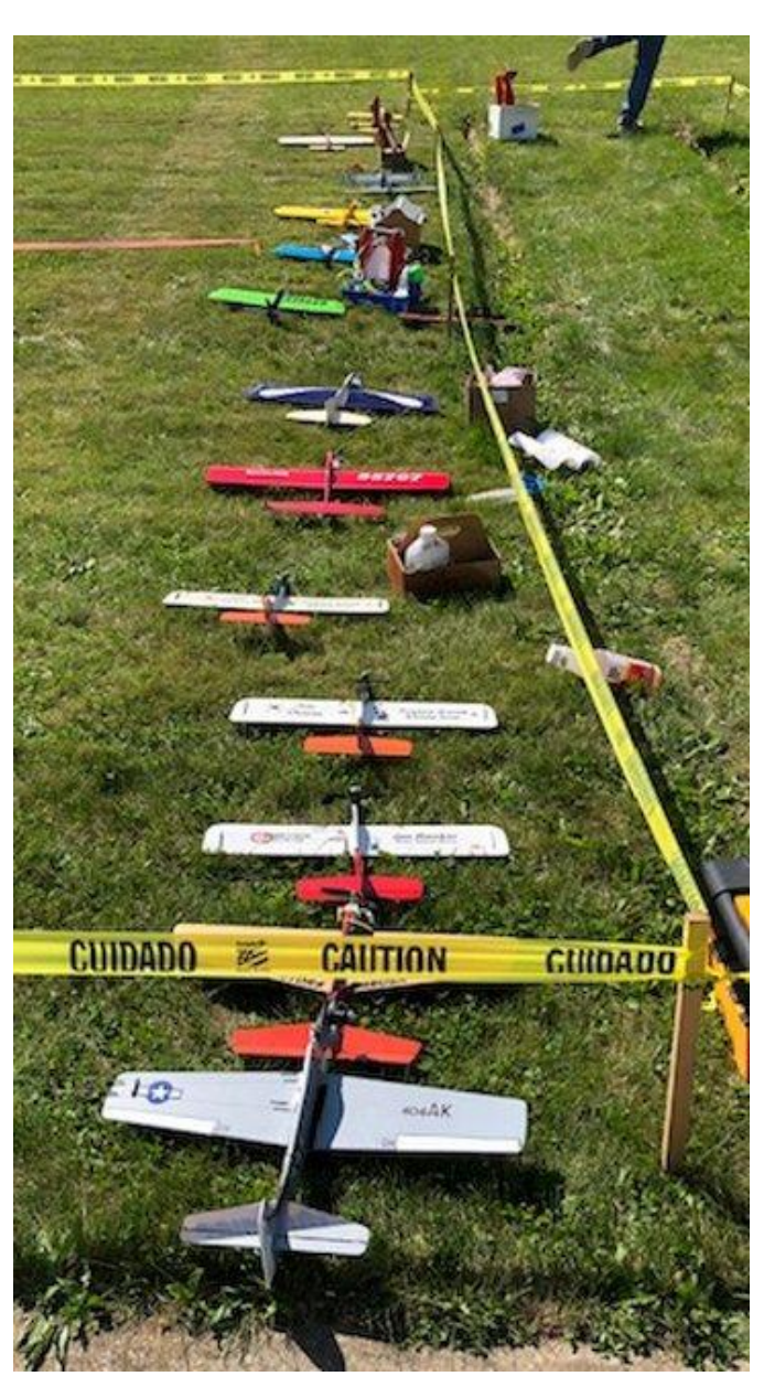
The Pits at Treetown, Skyray Sport racers are among the many airplanes waiting their turn for flights.