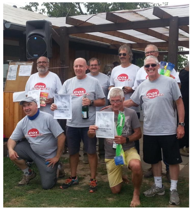
Race winners at The 1st Cox International Mouse Race (sorry, don't have all the names but Nice (Cox International) shirts though, right?

Then there was <u>Mause race</u>. The less said the better, but that wouldn't be fair to you readers now, would it? Like all catastrophic disasters it's never just one thing, it's all a bunch of little things that culminate into the "Grosse Katistrophe". I guess I was a bit lazy in preparing. I had tested one good model/motor the previous weekend in Regina, Saskatchewan at the Moisuk C/L Fellowship event.