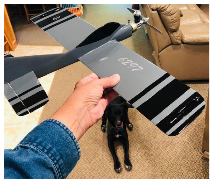
Tim Stone's new Skyray Sport Racer. Note the four-legged helper giving his approval to a job well done.

The very next weekend Treetown ran its 1/2 A contest featuring stunt, scale & a Skyray sport race. 100 lap, 35' lines, 8cc tank, no spring starters, reed only general rules. Hand launch & grass flown leads to a fair amount of comedy.