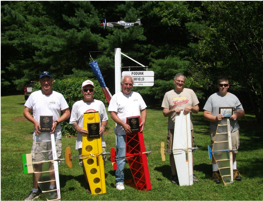
The top finishers at the 2019 Central Mass Championships