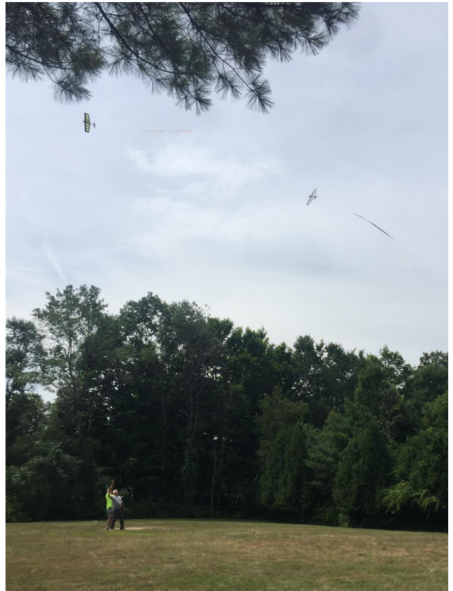
Neil Simpson and Brian Stas mix it up in the final match