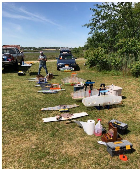
The pits at the Summer Fly-Off