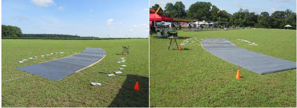
ESAC Navy Carrier Deck Built for the 2021 Contest Season

During 2019 we put arresting lines on the ground and used coroplast to take off. This year ESAC provided a deck. It will get a little tweaking during the off season, but it is a great deck.