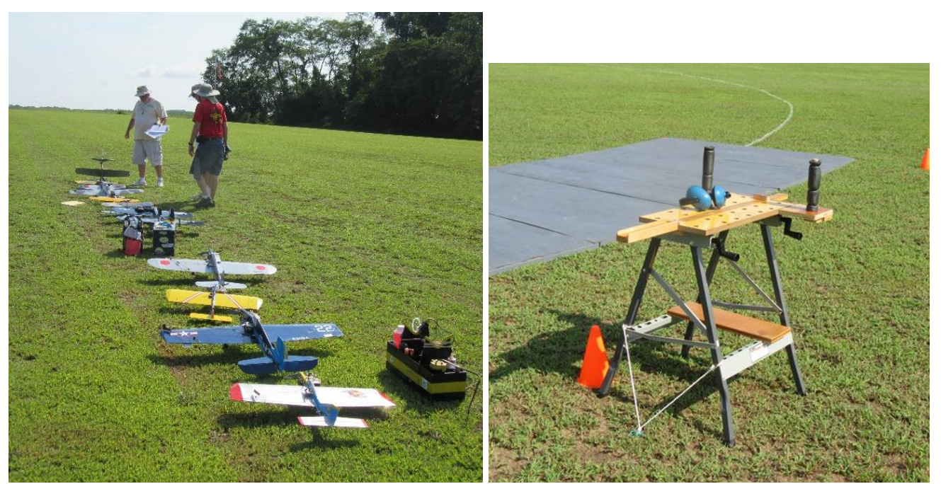
Processing the models

We had six contestants make official flights in Profile, Sportsman Profile, Fifteen, Nostalgia Profile and Nostalgia I. That was a letdown after the eleven flyers we had in 2019 but it will improve with time.