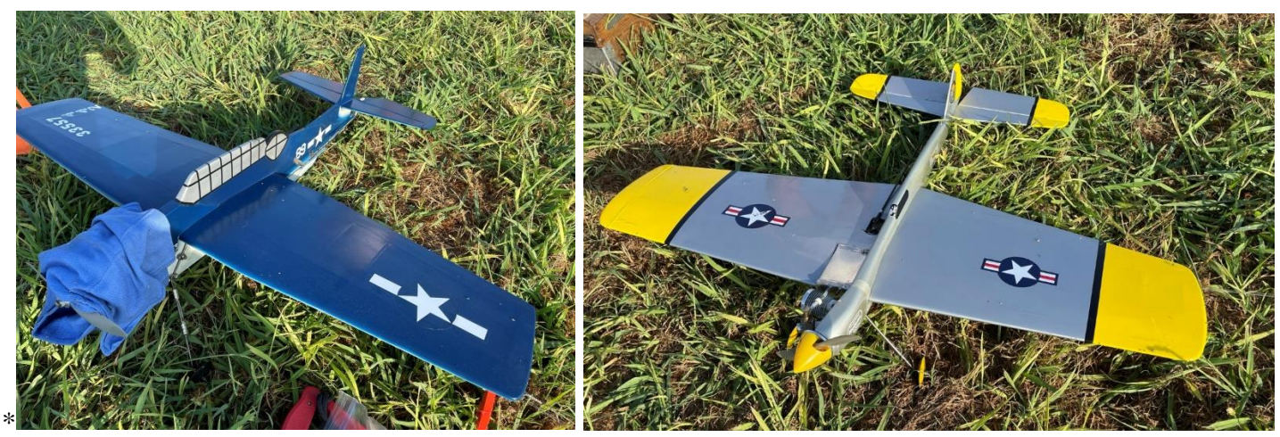
Grumman TBF/TBM Avenger