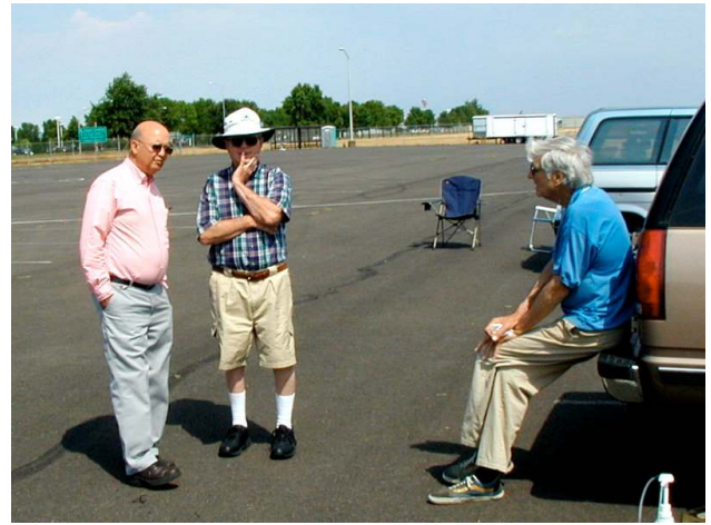
Discuss the finer points.