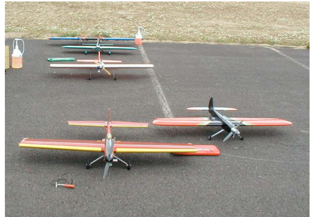
Waiting for their turn to fly