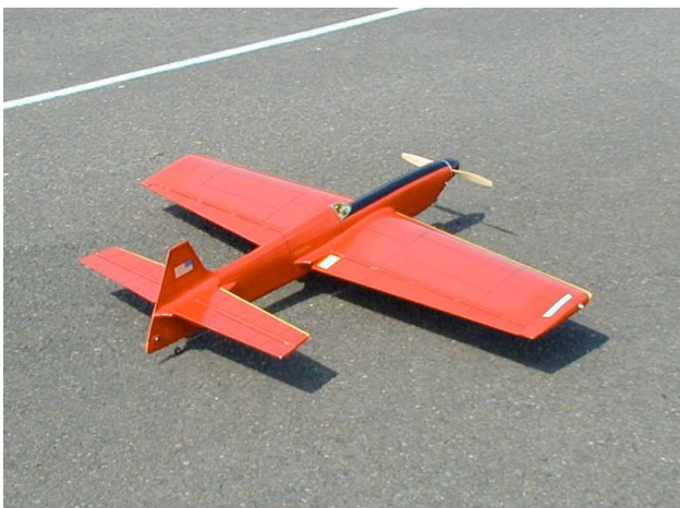
Waiting for a pilot.