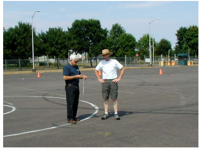
A couple Mikes talking handle.