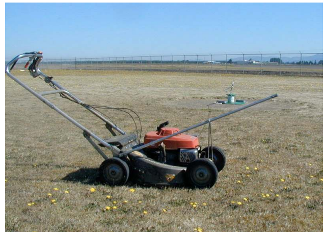
The WEED eater!