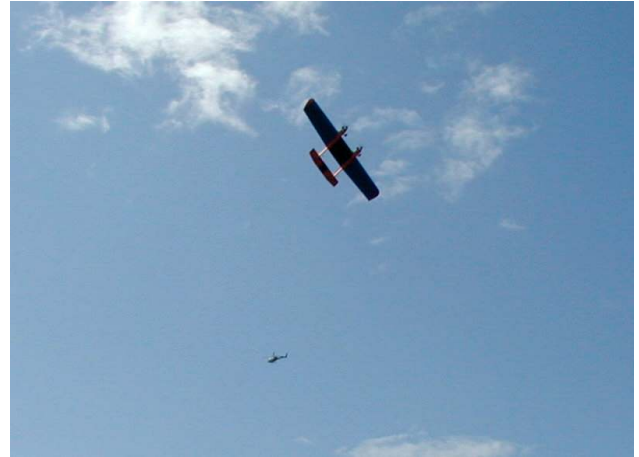
The Evil Twin returns. ( also Heli leaving airport )