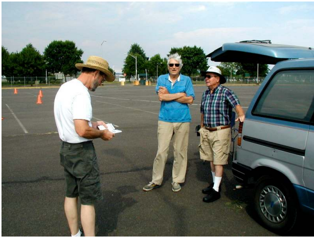
A brief meeting