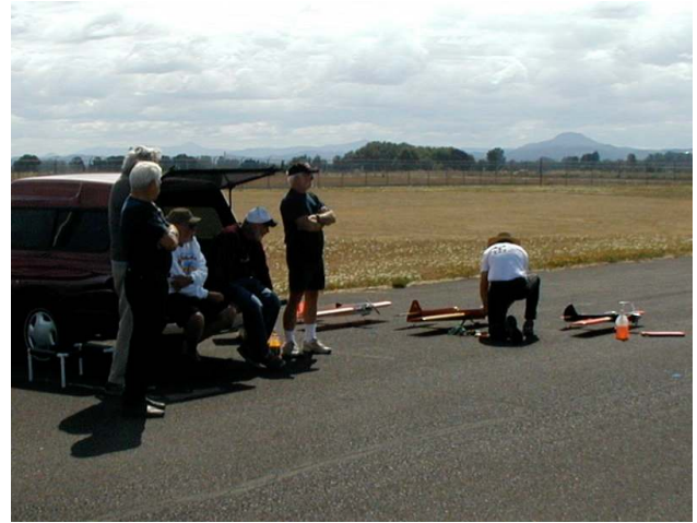
Getting ready to call it a day.