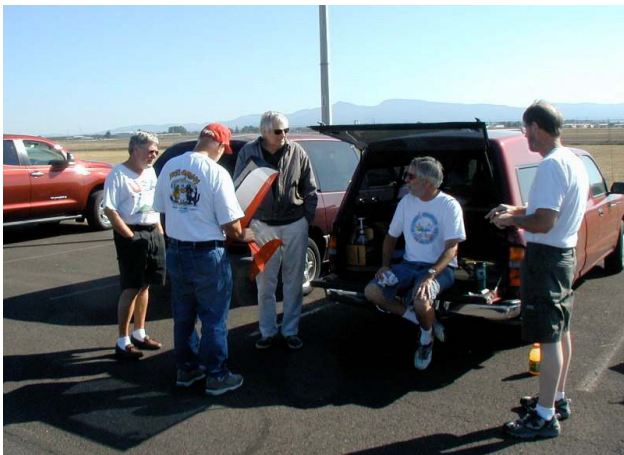
Flite Streak Talk