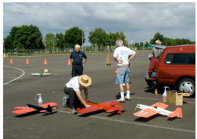
Waiting for the wind to mellow a bit.