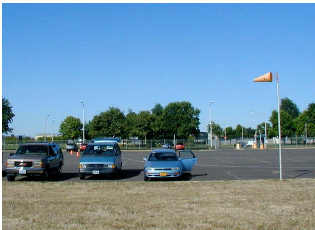
The wind sock shows HOW WINDY it was.