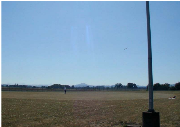
Gene outran the wind.