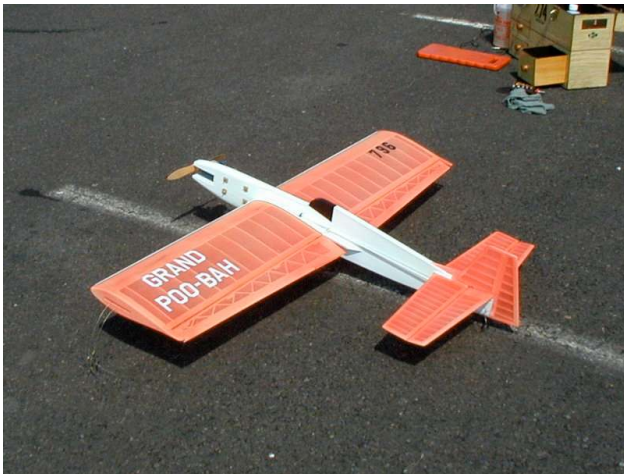
Grand Poo-Bah ready