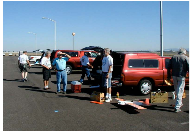
Time to go.