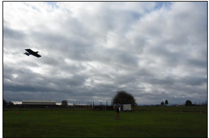
Gary flying Flite Streak