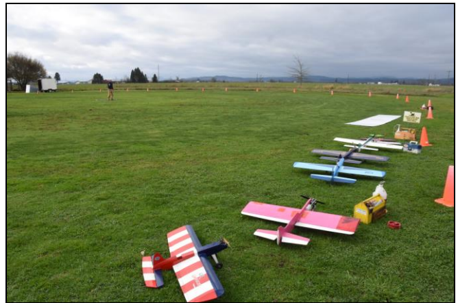
Takeoff strip and plane lineup.