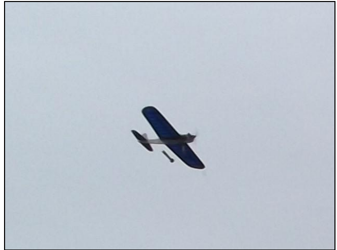
A closer look