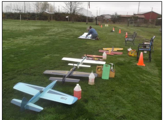
Aircraft ready for flying