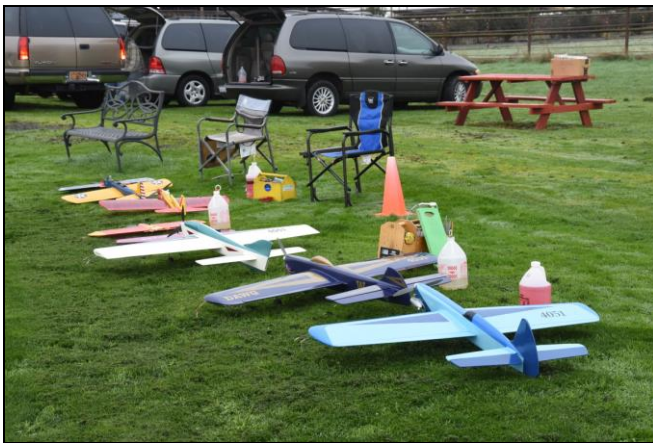
Nov. 20 plane lineup