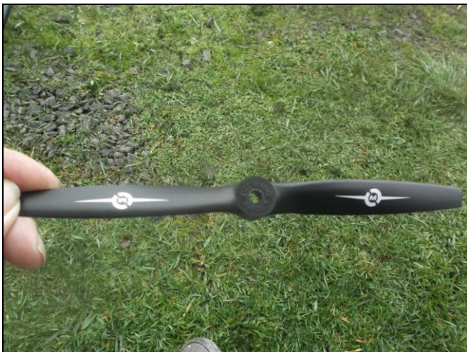
Prop show and tell