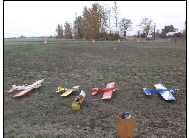
Lines out and ready