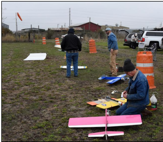
The pit area