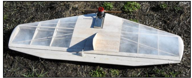
Gene's new Half Fast III, another vintage combat plane.