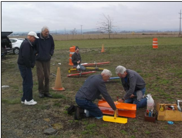
Sometimes it takes four to start a biplane