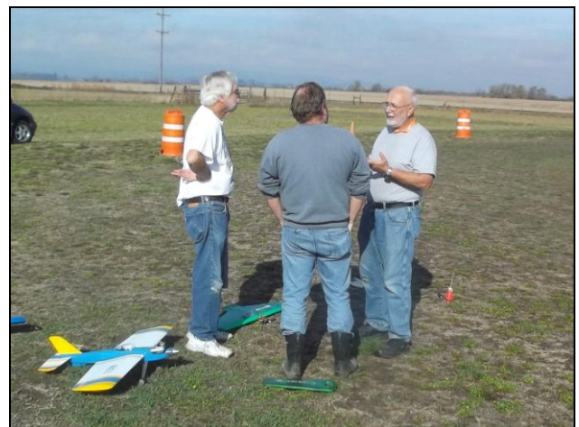
Discussing the weather