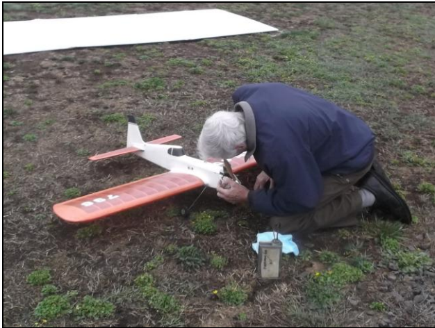
Floyd Carter prepping