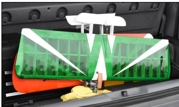
Two of Gene's vintage combat planes. Green one is a VooDoo; orange is a Sneeker.