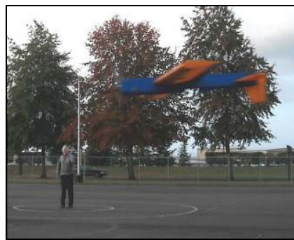
Appears top heavy now.