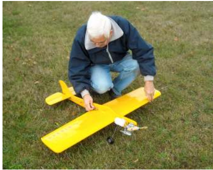
Tighten nut on clevis.