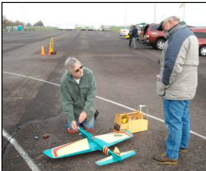
Yes, it is cold.