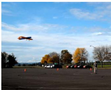
Floyd's fast Electric in the air.