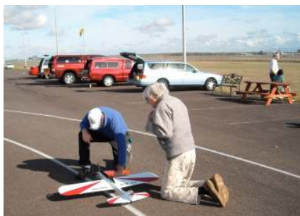
Starting the Dolphin.