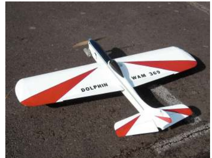
Another FISH is ready.