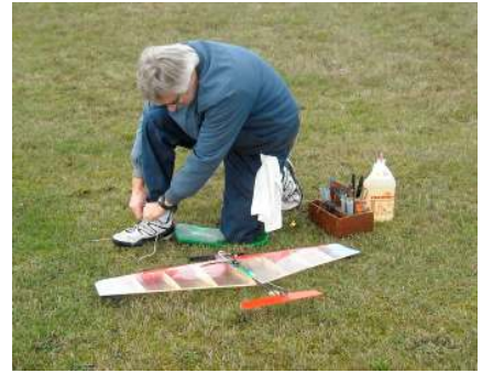
Tie the shoe FIRST!