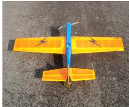
Floyd added art to slow it.