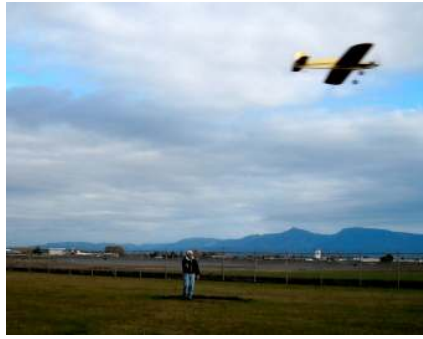
That fixed it!