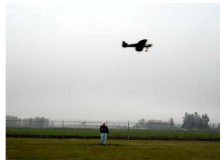
Too fast to tell.