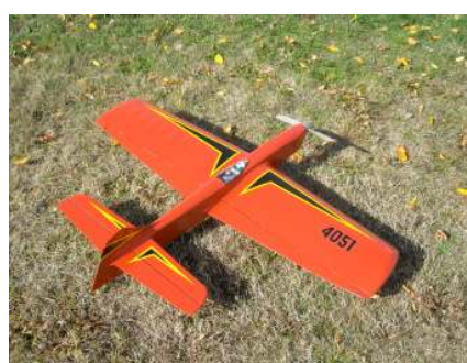
Waiting to go.