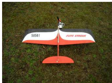
Black, White and Red.