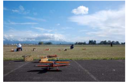
Lineup of planes.