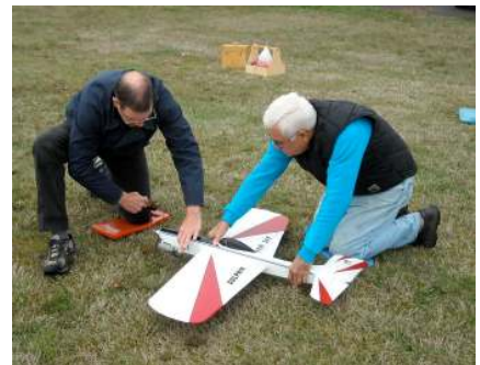
A pair of Mikes