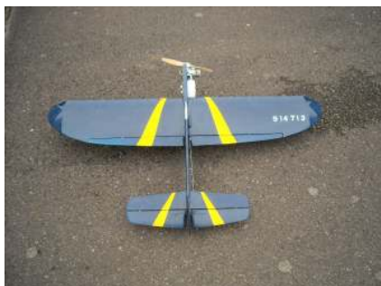
Black and Yellow.