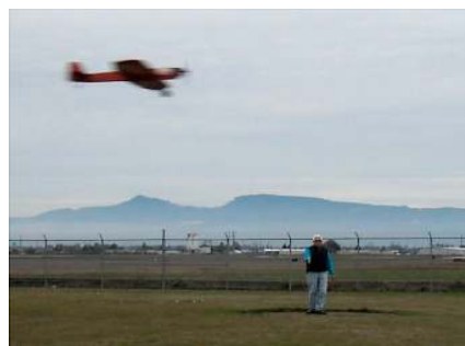
It flies well.