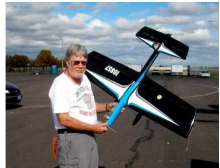
Tom's Show Stopper.