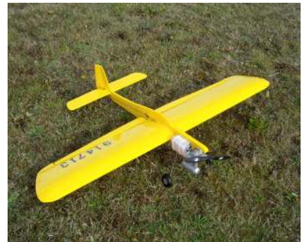
Ready for maiden flight.