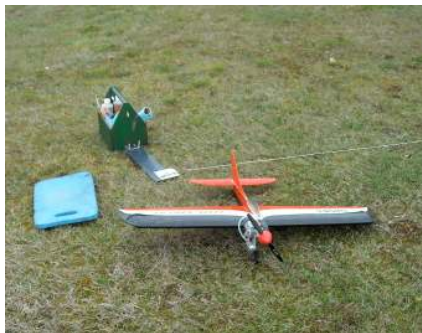
Just needs fuel.