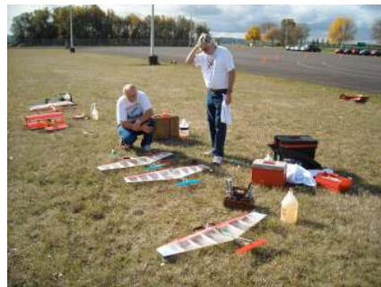
Which one do I fly first?