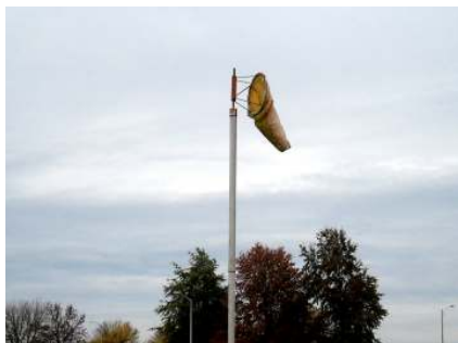
Ok, where is the WIND?