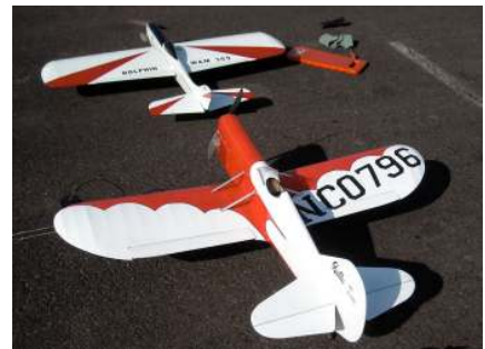
Floyd Carter's GeeBee.