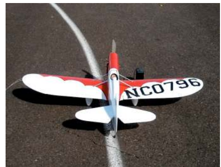
Ready to fly.