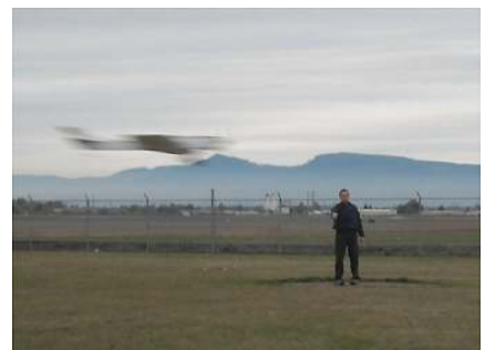
A flying Dolphin!