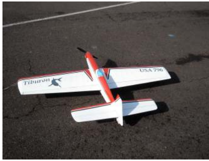
Floyd Carter is ready.