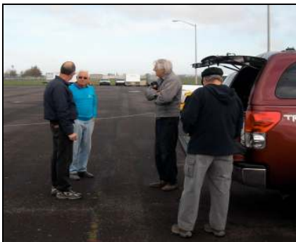
It is getting warmer, well...