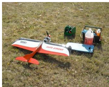
Flite Streak Resting.