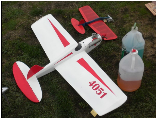
John's Super and Baby Ringmasters