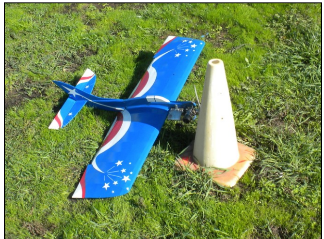
Gary's Flite Streak