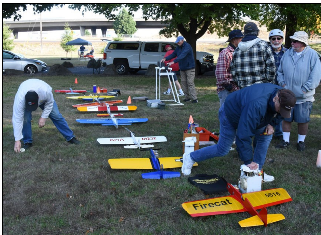
Old-Time and Classic planes lined up in the Delta Park pits on Saturday.

In a small contest like the follies, it takes everyone on hand to help out and make the days run smoothly, and everyone there pitched in mightily to make the Follies a success.