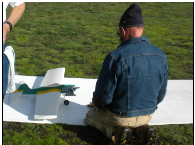
Gary's Ringmaster getting ready to fly