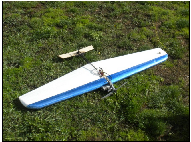
Russ's 80mph Combat plane