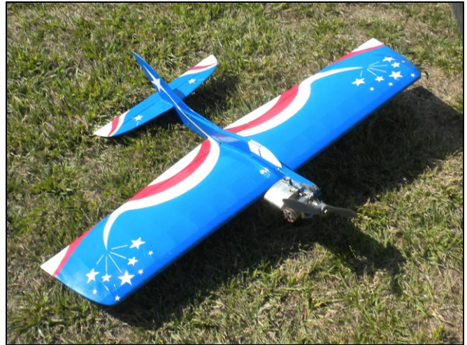
Gary's Flite Streak