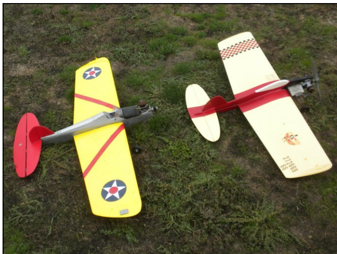
Dave's Super and S-1 Ringmasters