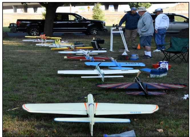
The Precision Aerobatics pits on Sunday.