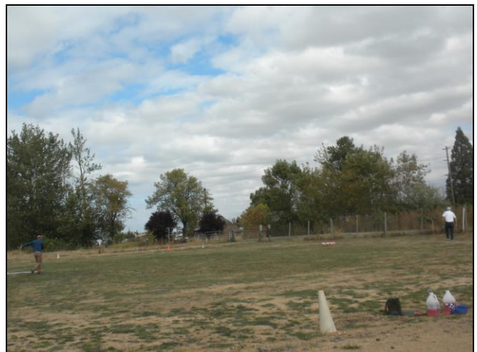
Gary landed way out there