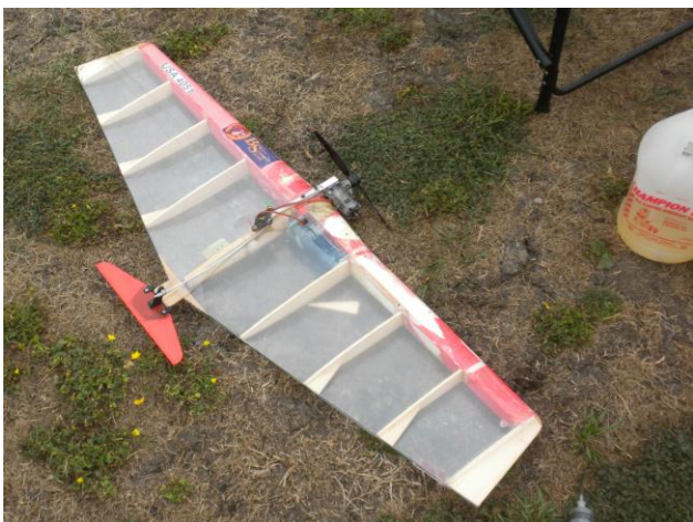
Gene's Aerohobby YMS-1 F2D