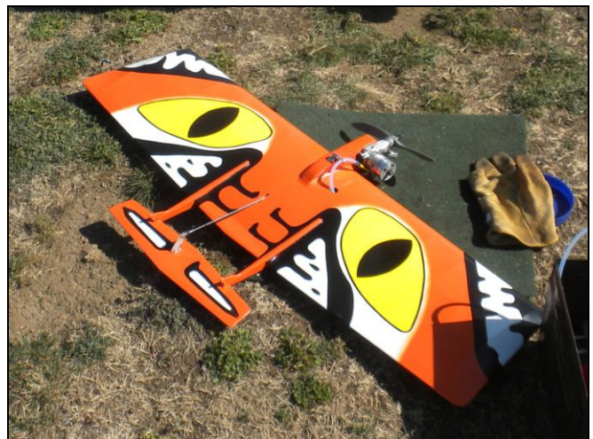
Gary's Combat Cat 1