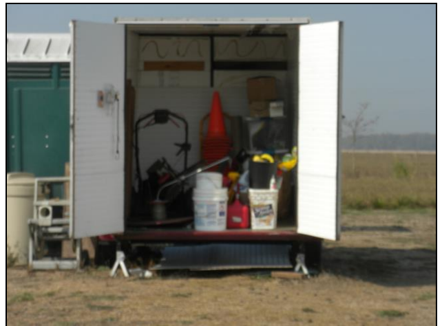
Sides replaced, back and top to do yet

Repairs nearly completed. As of October 18.