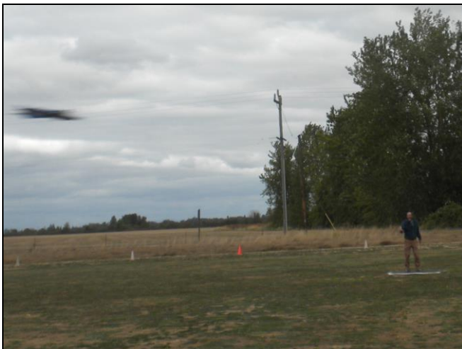
Gary making a landing approach