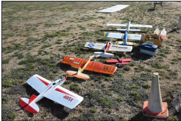
Just a pit lineup.