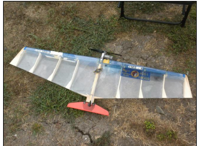
Gene's Aerohobby YMS-1 w/ Fox Stunt 35