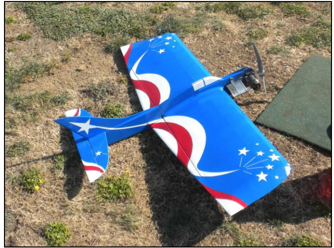
Gary's Flite Streak