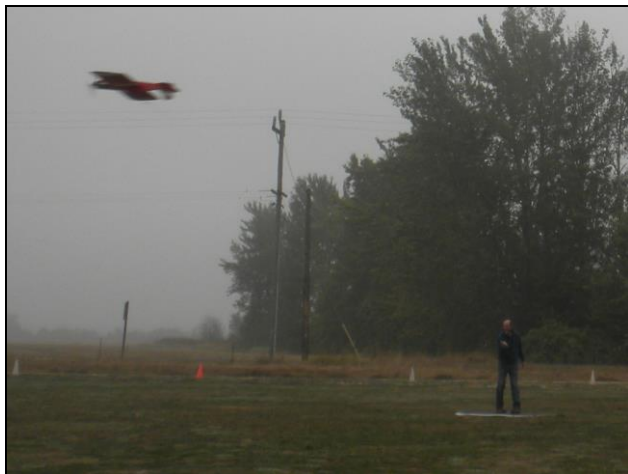
Gary flying up side down