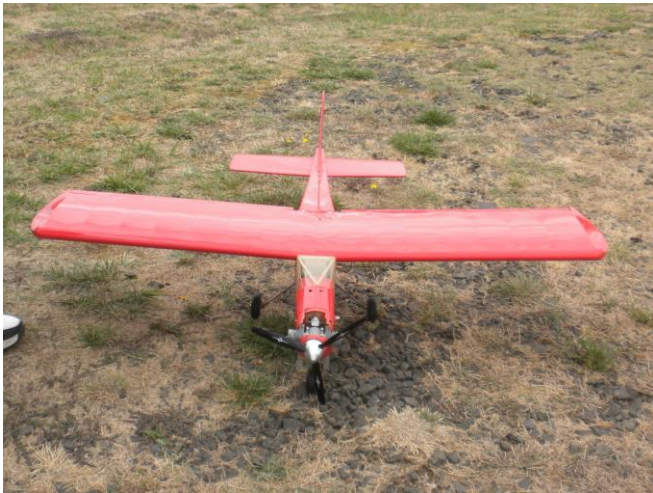
Mike's twin ready to start