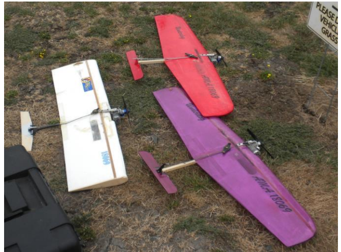
Gene has three ready to fly