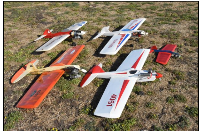
Ringmasters to be flown in the Global Ringmaster Fly-a-Thon.