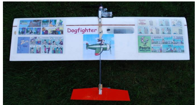
This model is powered by the Fox Mark IV Combat Special.

The fuselage and tail are the more recent engine pod with metal engine mounts and carbon tube boom with removeable elevator. The original Dogfighter had internal controls and cored wing panels. This model has solid wing panels and external controls.