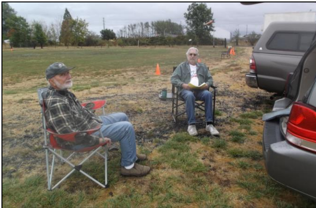
Ready for the meeting