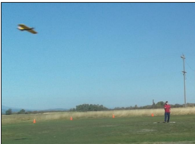
Gene SPORT flying