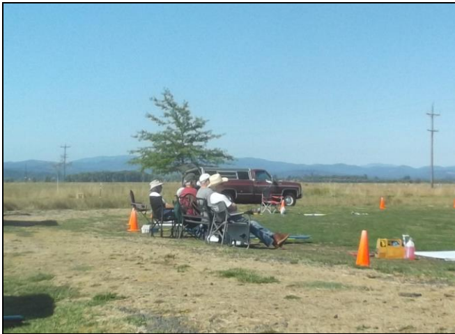
Too much supervision