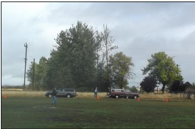
Down wind side of the field