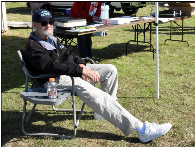
Behind the scenes workers make the contest happen

See flyinglines.org for a full report http://flyinglines.org/follies.21.html