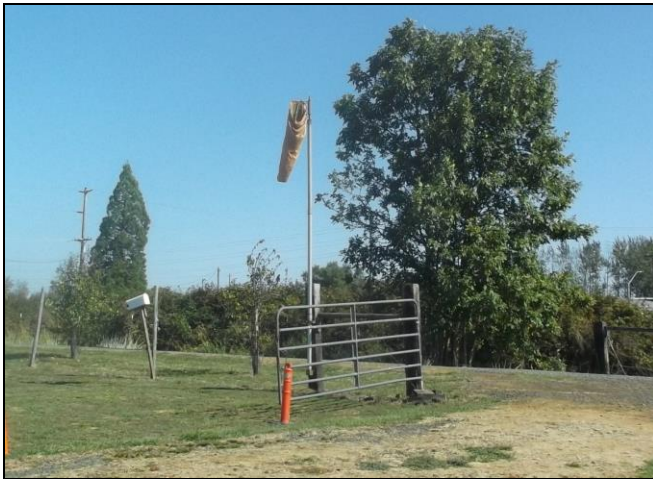
Sock waiting for the wind to arrive