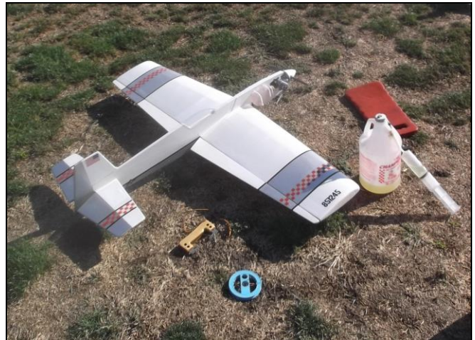
Mike ready to fuel it