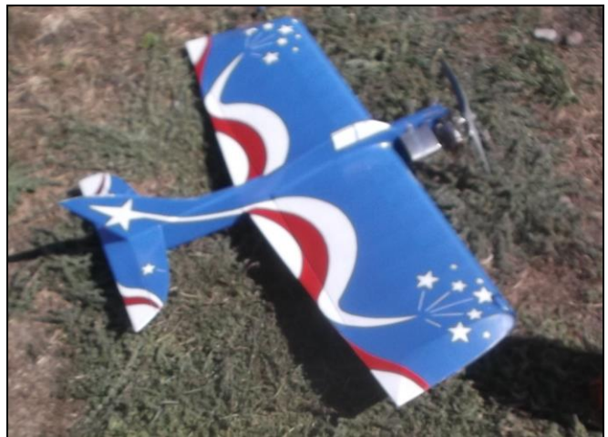
Gary has this one fueled and ready to fly