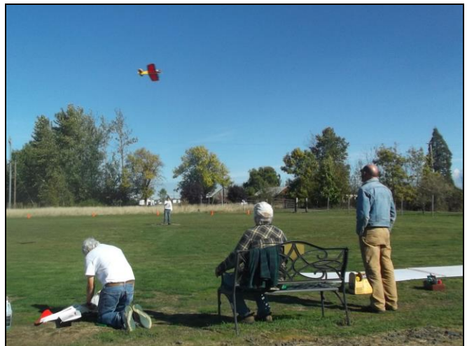
Dave flying first flight after surgery