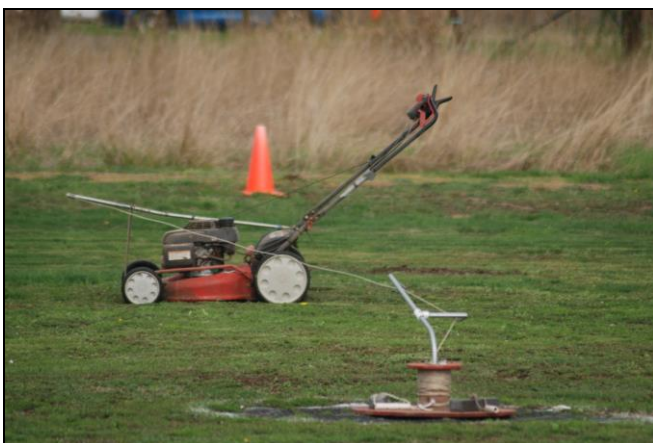
Automatic circle mower in action.