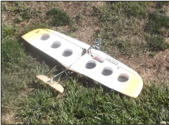
Gene's plane waiting