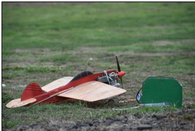
Jim Corbett's Ringmaster ready for action.