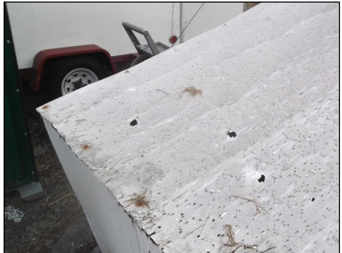
Mower shed needs repair