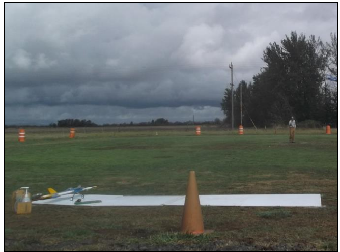
Gary launching from manual stooge