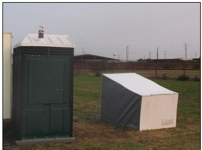
Mower shed repair complete