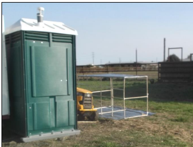
Mower shed being repaired