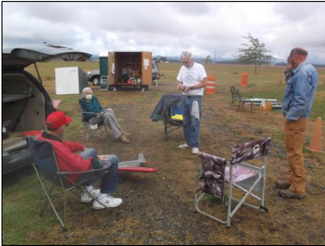
Ready for a meeting