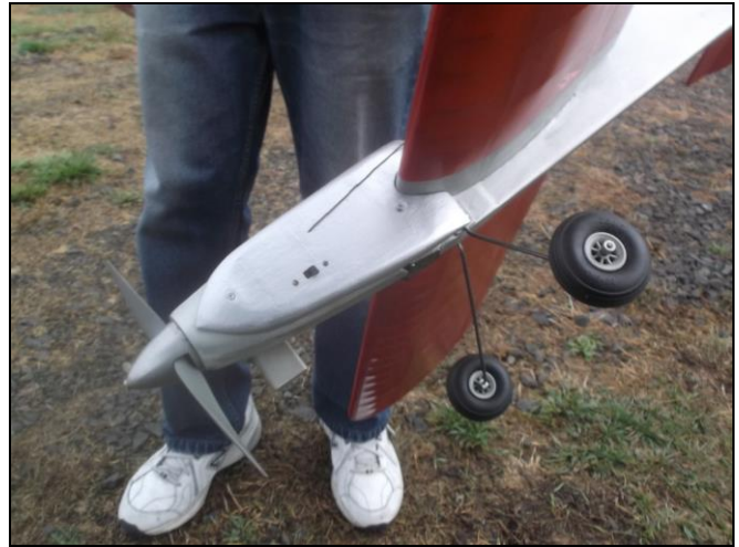
Mike Denlis adds RC throttle control to trainer