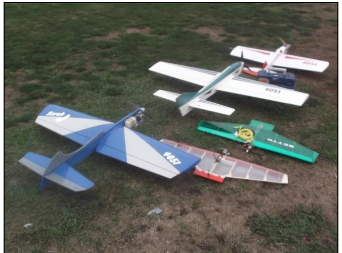
Two electrics, three fuel aircraft