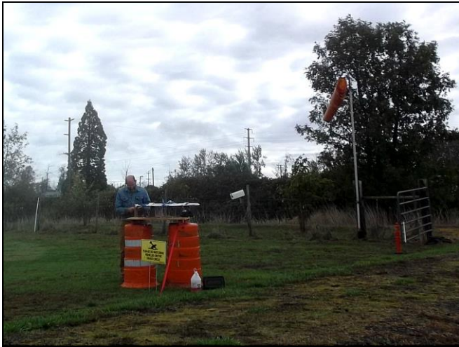
Gary's launches are amazing