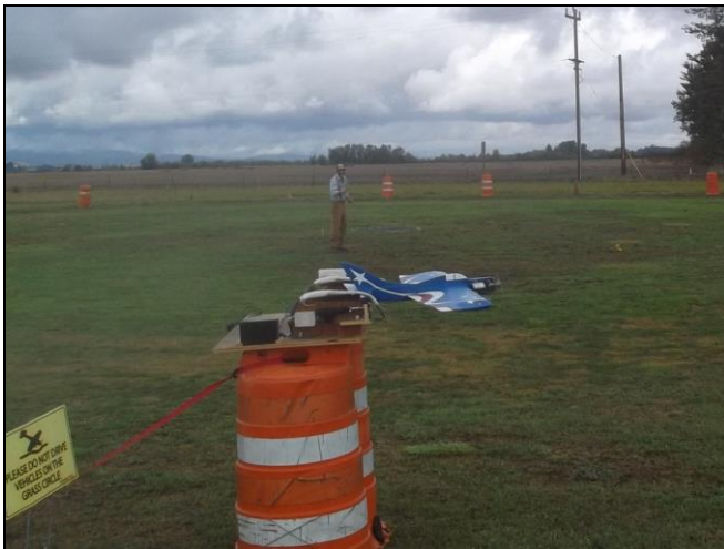
Gary launching from electric stooge