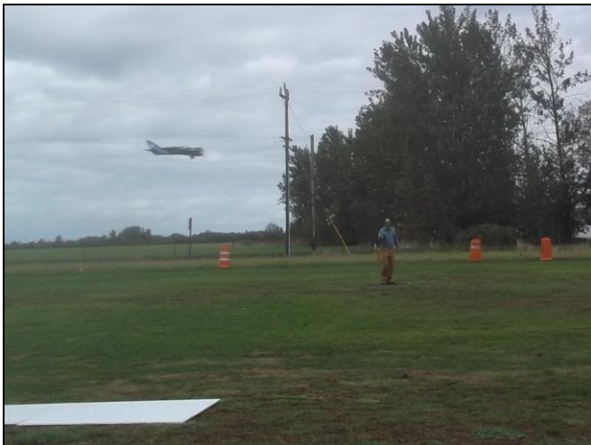
Gary ready to land