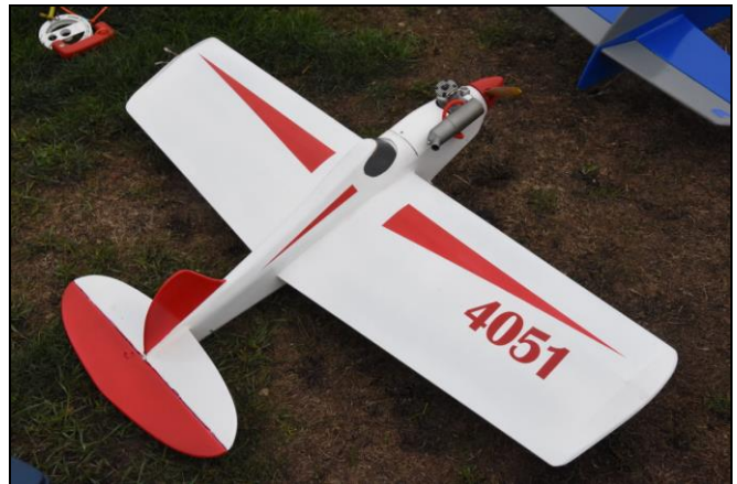
John's Super Ringmaster, ready for flight.