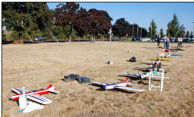
The Precision Aerobatics flight line on Sunday.