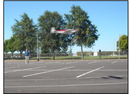
The shadow seems faster!