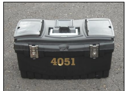
John's new tool kit