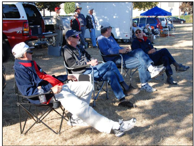
With temperature around 80, the shade on the south side of the circle was a popular spot for watching the flights.