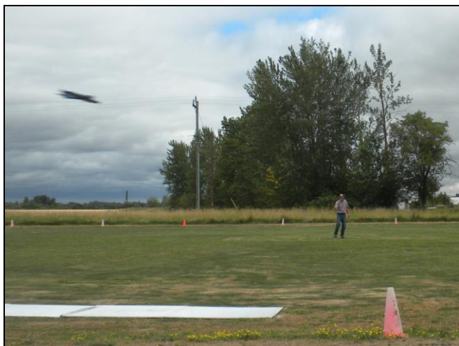
Gary making a landing approach