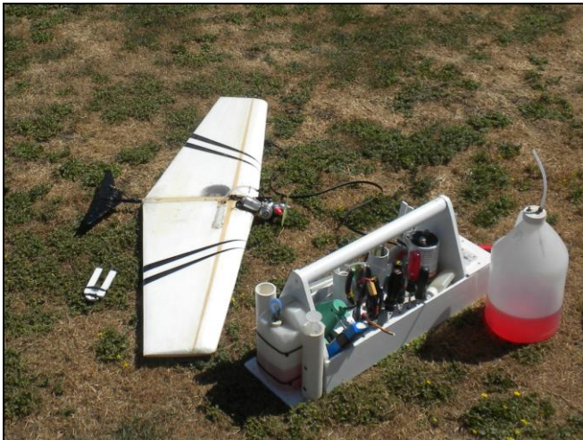
Russ's plane ready