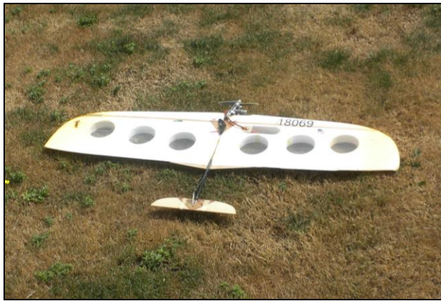
After a smooth landing