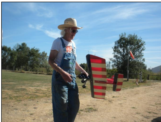
Hard landing resulted in anhedral wing