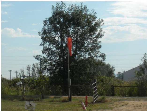
And sometimes no wind