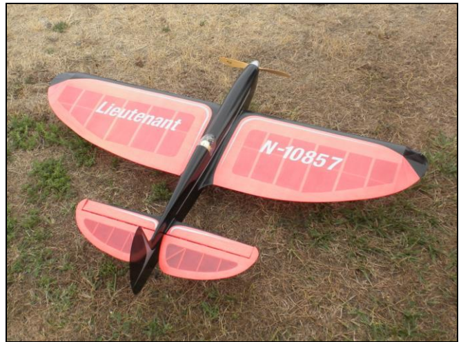
Tom has a Lieutenant for sale