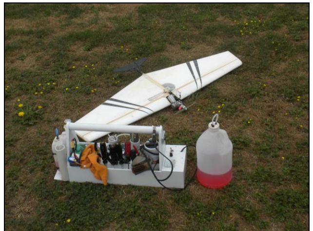
Russ has one waiting