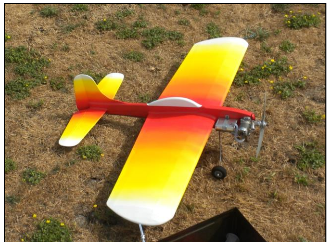
It looks good on the ground