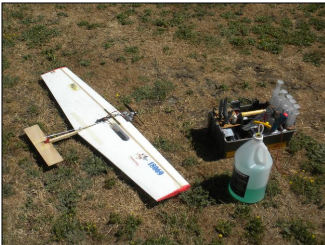
Gene's plane waiting