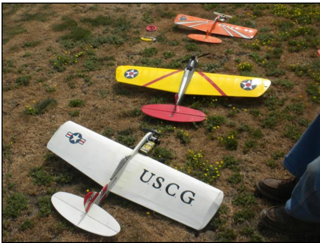
Dave's planes are waiting