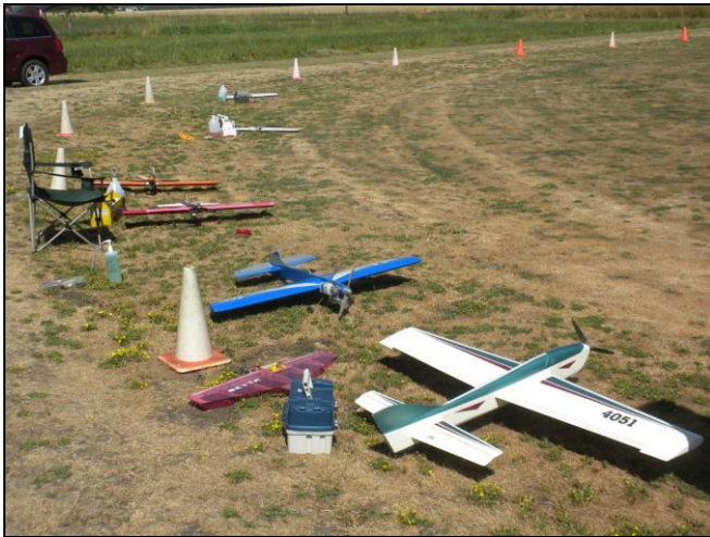
Ready to fly