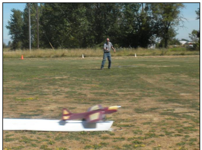
Great use of the launch pad