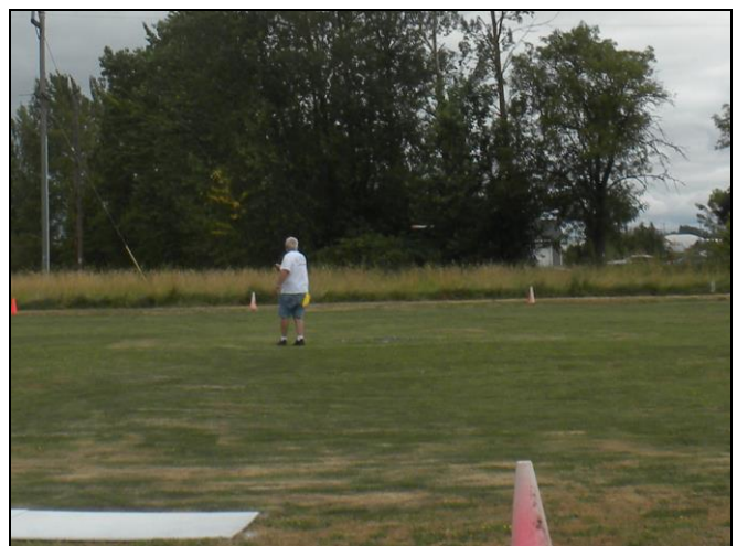
Gene about to land