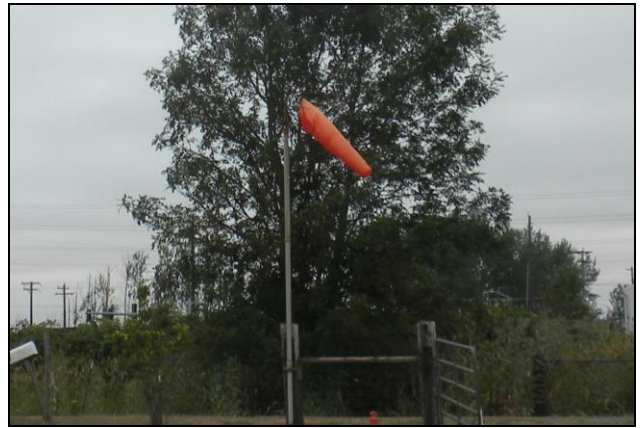
Yes there was wind