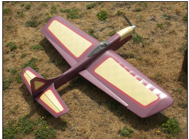
After a great landing